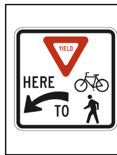
R1-5 ALT "B"