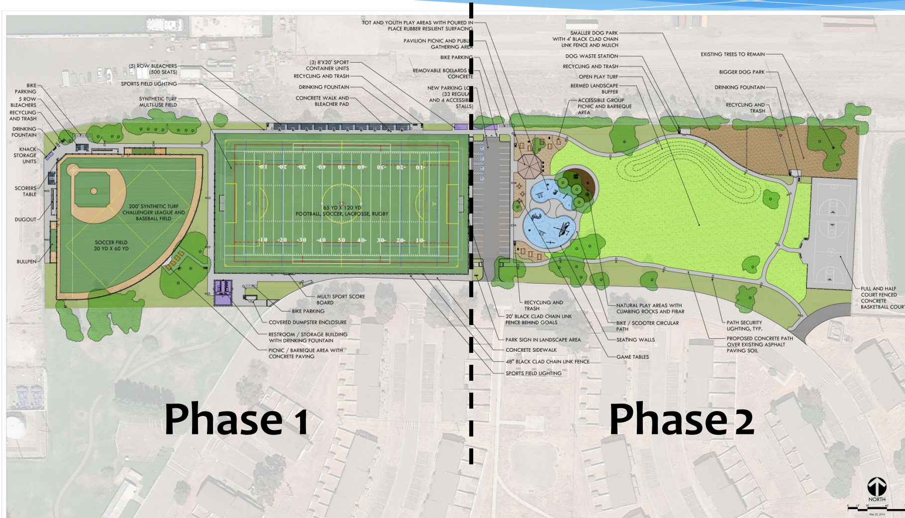
Schematic Plan Estuary Park Athletic Field Complex Renovation Alameda, CA