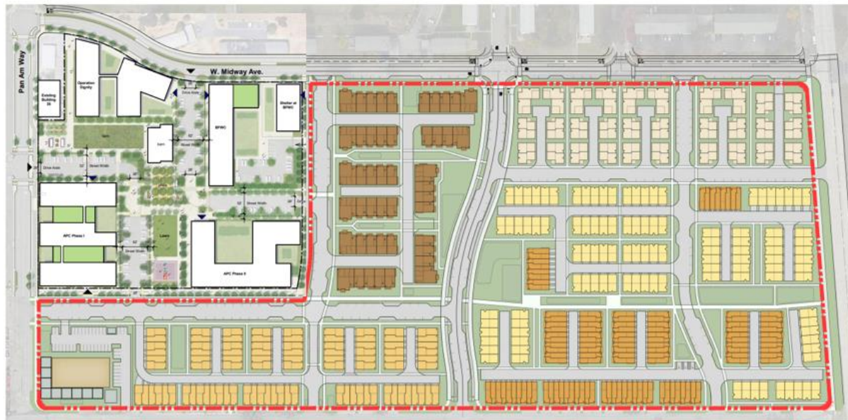
Figure 1: West Midway and RESHAP Site Plans

The proposed projects include a variety of building types, including townhomes, condominiums, stacked flats, and commercial spaces. All the residential buildings will be between three and four stories with a maximum height limit of approximately 50 feet. A freestanding one story commercial building is proposed at the corner of Pan Am and West Tower in the lower left corner of the property.