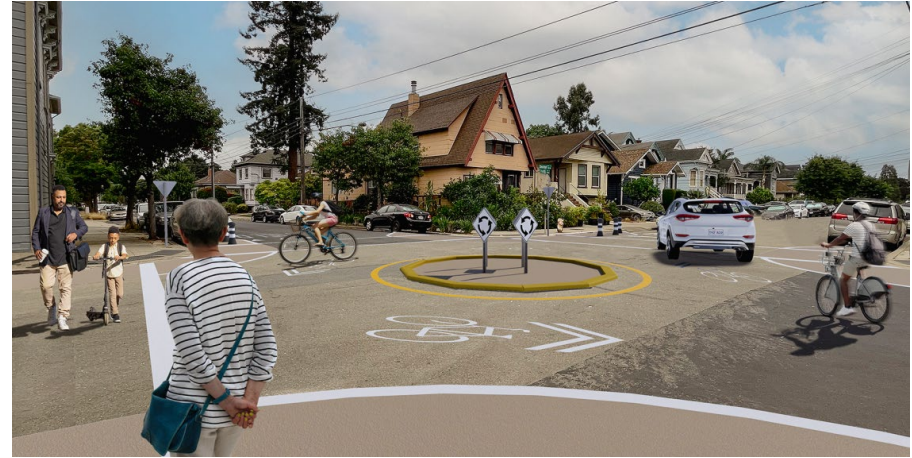
Neighborhood Greenway tools: traffic circles, curb extensions, speed humps, etc.