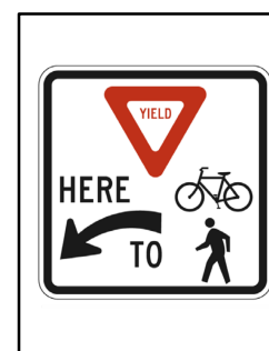
R1-5 ALT "B"