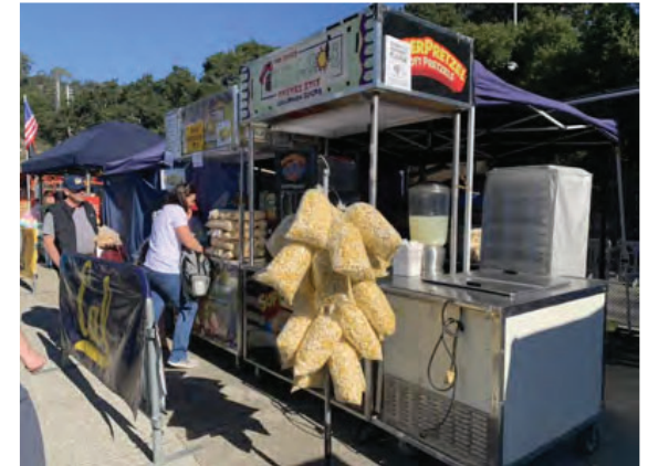
Mobile "Push" Carts