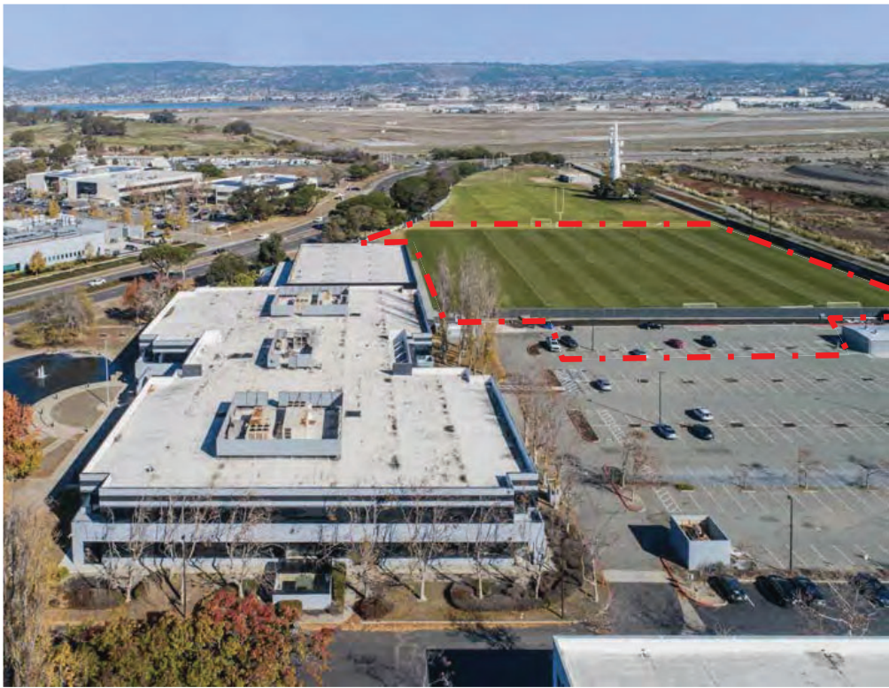
Oakland Roots & Soul SC Training Facility Proposed Venue Improvements