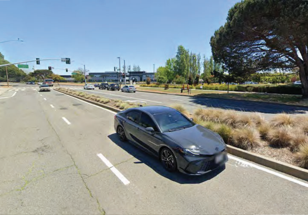
From Harbor Bay Parkway Looking Southeast Toward Property