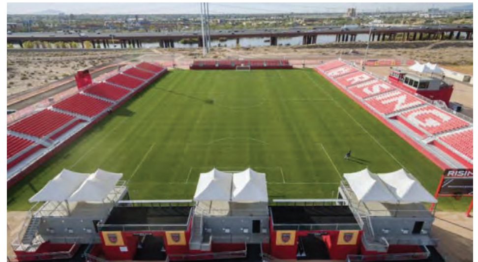
MODULAR GRANDSTAND SYSTEM Examples