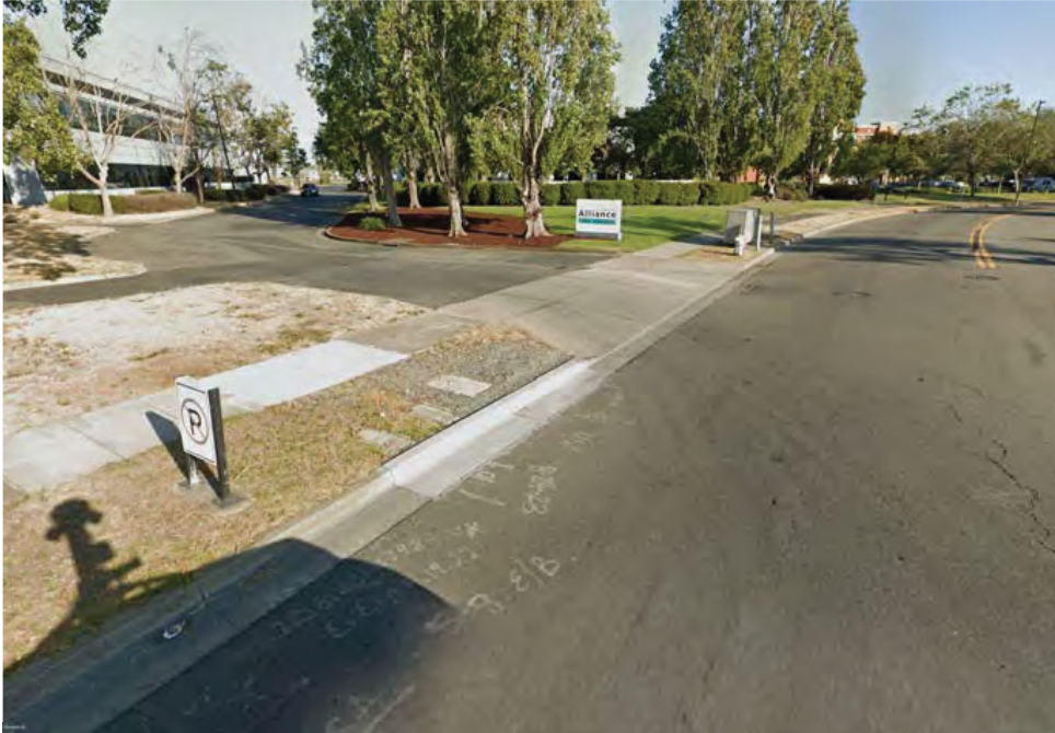
Main Driveway to Property from Harbor Bay Loop Road