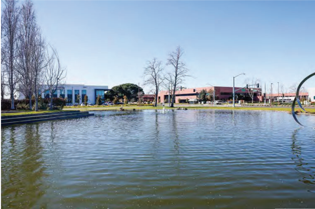
From Property Looking West Toward Harbor Bay Loop Rd and Harbor Bay Parkway

Oakland Roots & Soul SC Training Facility Proposed Venue Improvements