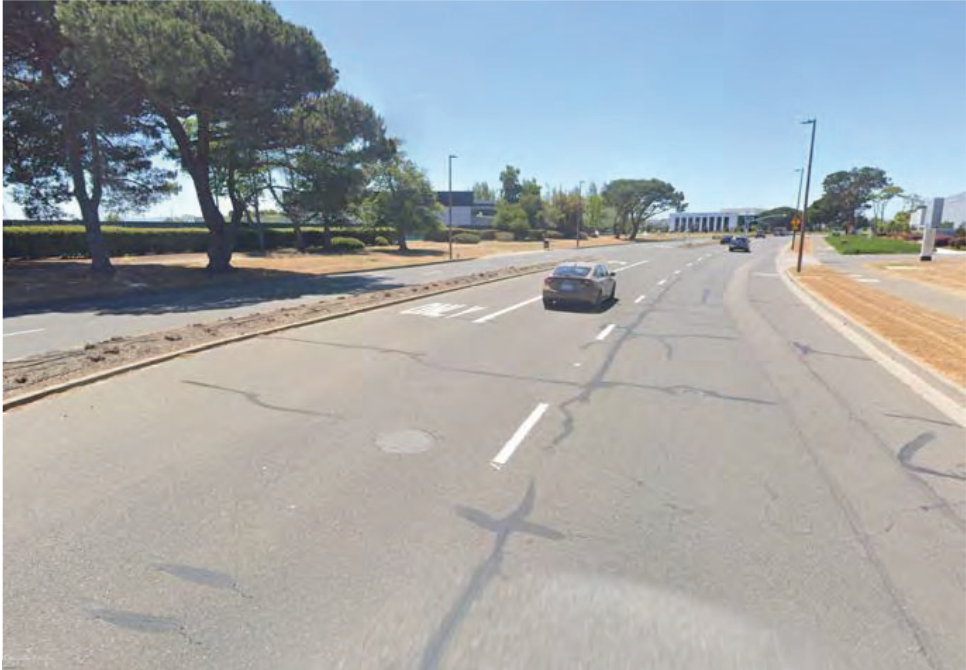
Harbor Bay Parkway Looking West (Property on Left Side)

Oakland Roots & Soul SC Training Facility Proposed Venue Improvements