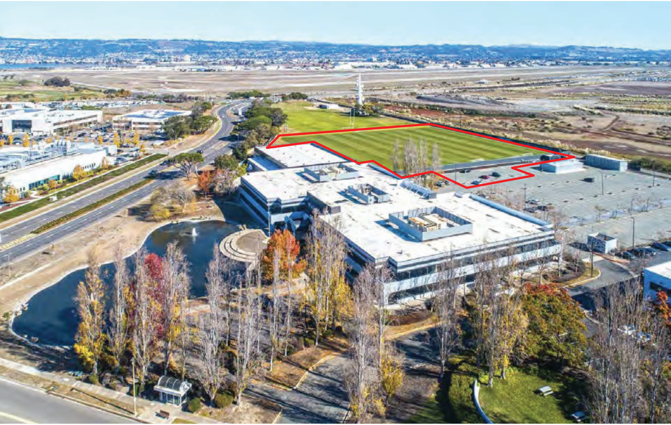
Oakland Roots & Soul SC Training Facility Proposed Venue Improvements