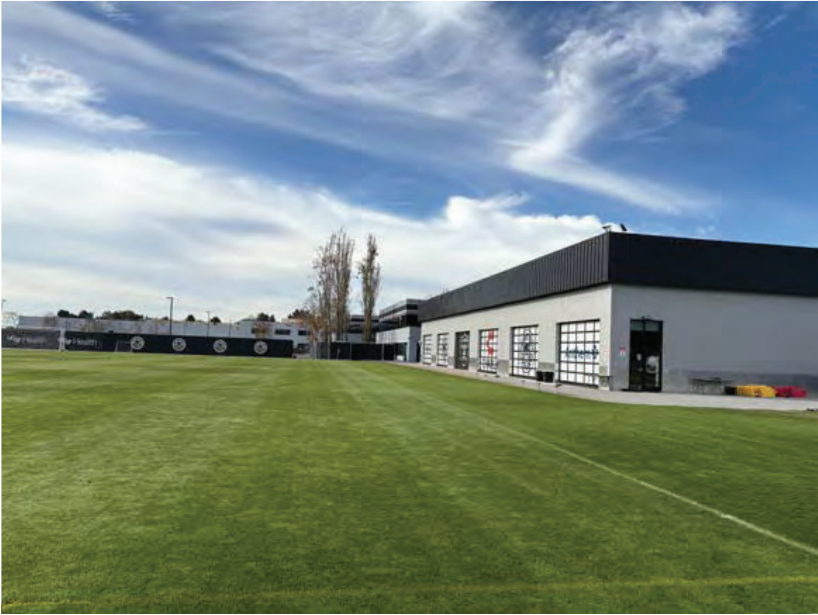
View From Field Toward Parking Lot