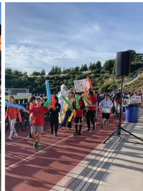
MATCH DAY ACTIVATIONS