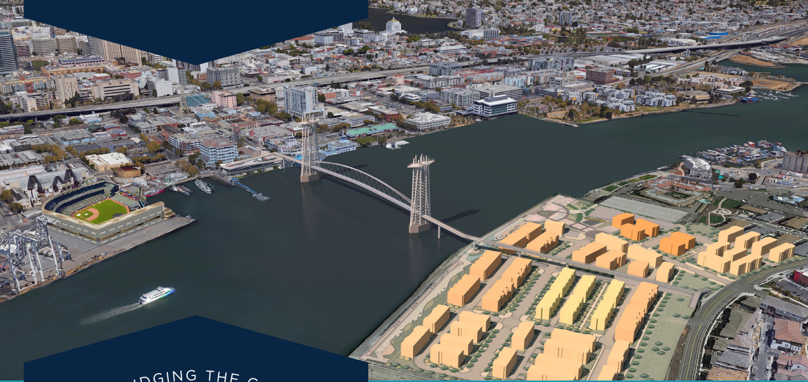
Rendering is for communications purposes; final bridge location is under evaluation.