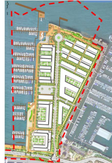
FIGURE 1.3 CONCEPTUAL ILLUSTRATIVE PLAN