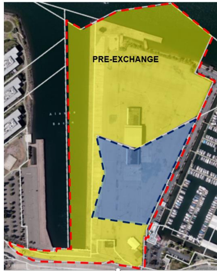
FIGURE 1.1: EXISTING PARCELS (PRE-TIDELANDS EXCHANGE)