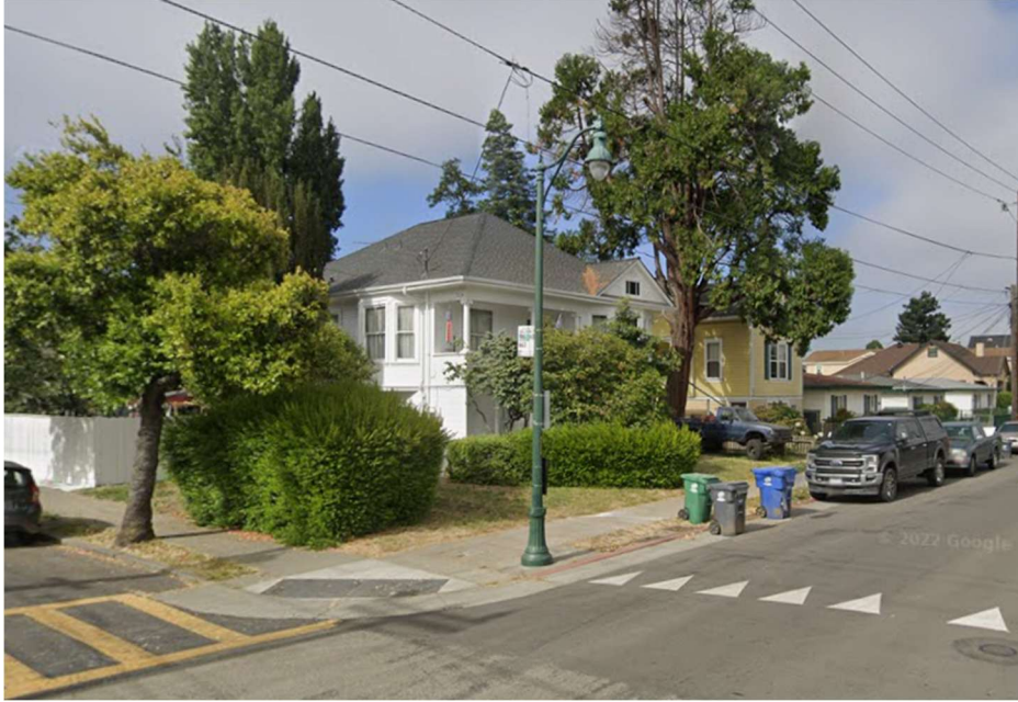
Figure B: Existing historical street light at Location 1.