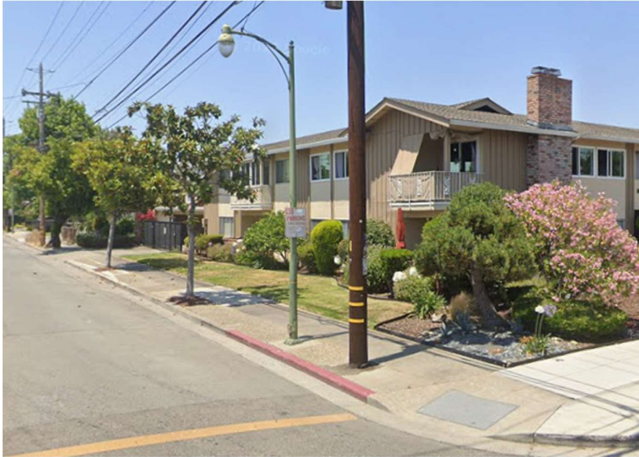
Figure H: Existing historical street light at Location 7.

The last historical street light impact is an octofluted pendant light located at the northwest corner of Lincoln Avenue and Broadway. The pole will be relocated approximately 4 feet northwest due to sidewalk re-construction.