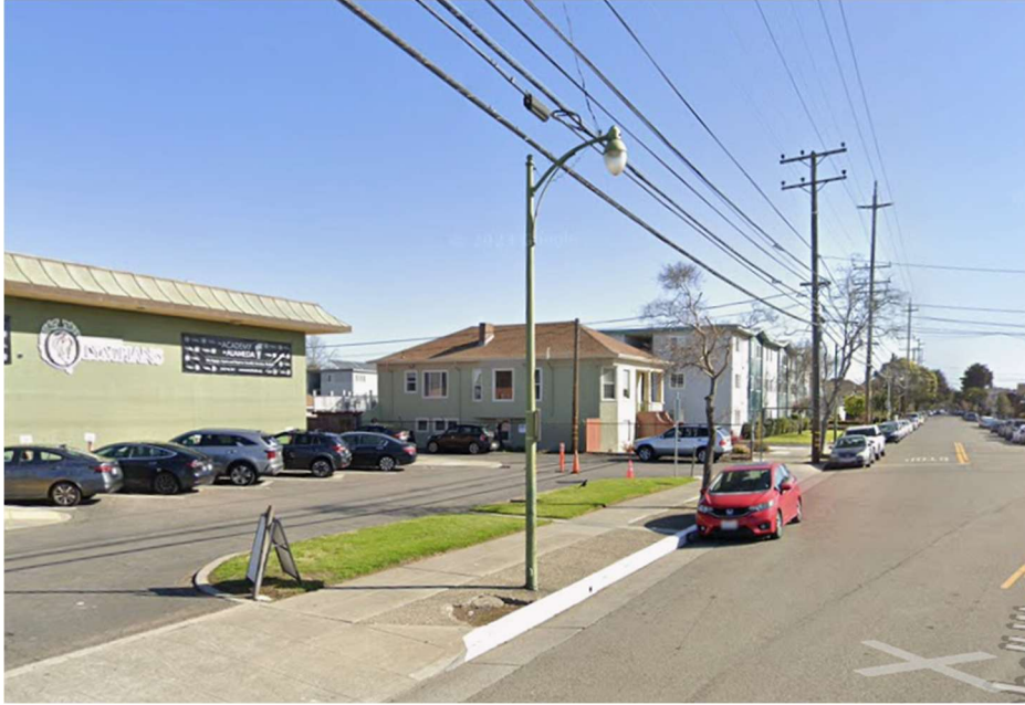
Figure D: Existing historical street light at Location 3.