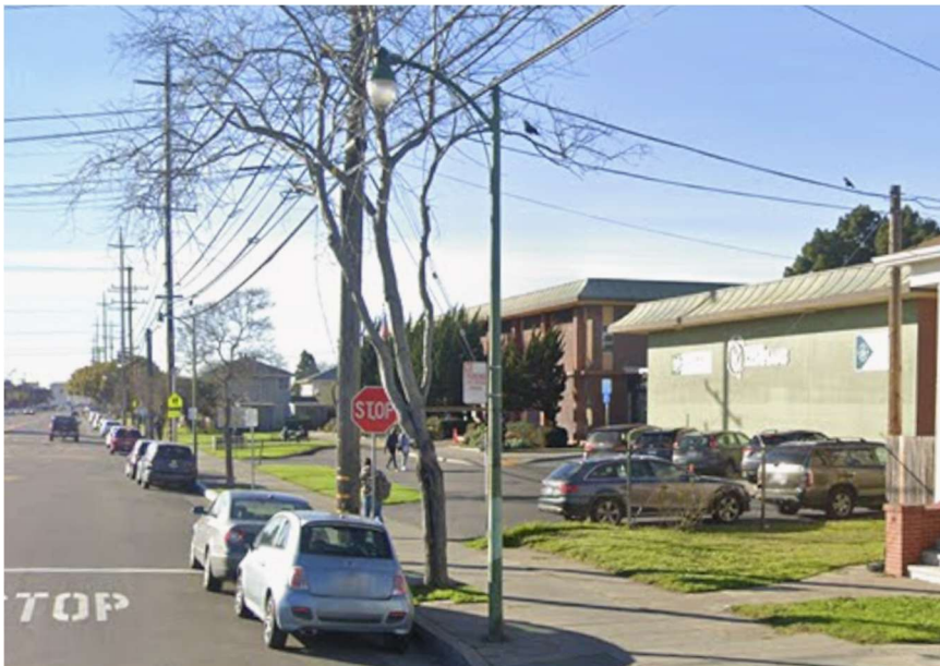
Figure E: Existing historical street light at Location 4.

The fourth historical street light impact is an octofluted pendant light in front of 425 Pacific Avenue. The pole will be relocated approximately 84 feet southeast on the opposite side of the street, to avoid interference with the proposed cul-de-sac.