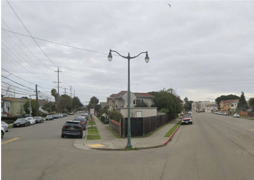
Figure F: Existing historical street light at Location 5.

The fifth historical street light impact is a 16-fluted double pendant light at the corner of Pacific Avenue and Marshall Way. The pole will be relocated approximately 14 feet southwest to avoid interference with the proposed cul-de-sac.