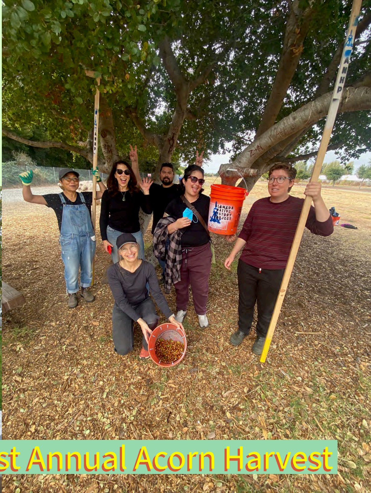
First Annual Acorn Harvest