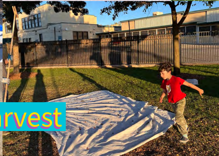
First Annual Acorn Harvest