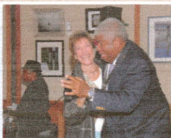
Live @ the Library Concerts