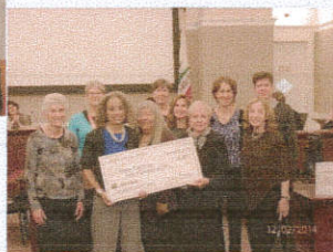
Campaign 2,015 by 2015