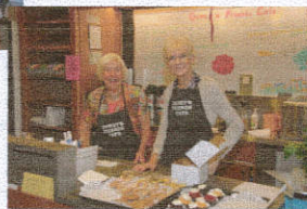
Dewey's Friends Café