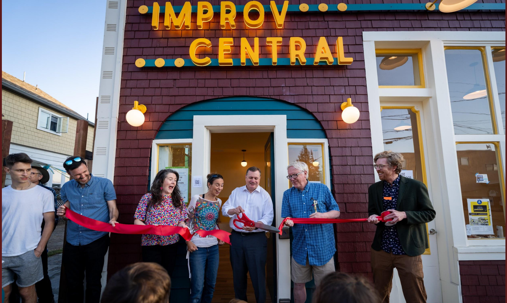
Sept 13, 2025: Our Grand Opening & Ribbon Cutting ceremony event with Councilmember Boller