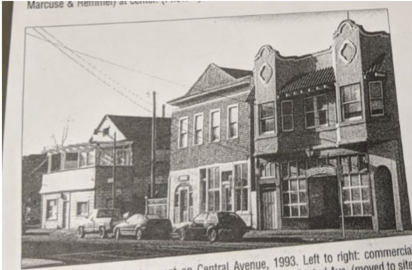
Fifth Street Station, looking east on Central Avenue, 1993. Left to right: commercial addition, 504-506 Central Ave. (1919); Kaney Building, 500 Central Ave. (moved to site, 1886); Suelflohn Building, 478 Central Ave. (1915).

fronts of houses on the north side of Central Avenue, two fine buildings went in on the south side of the street, and two gas stations were erected at the corner of Ninth and Central. In spite of subsequent remodelings, Caroline retains much of its original feeling. Nine prewar buildings and additions still stand, including the Dwinelle Building.