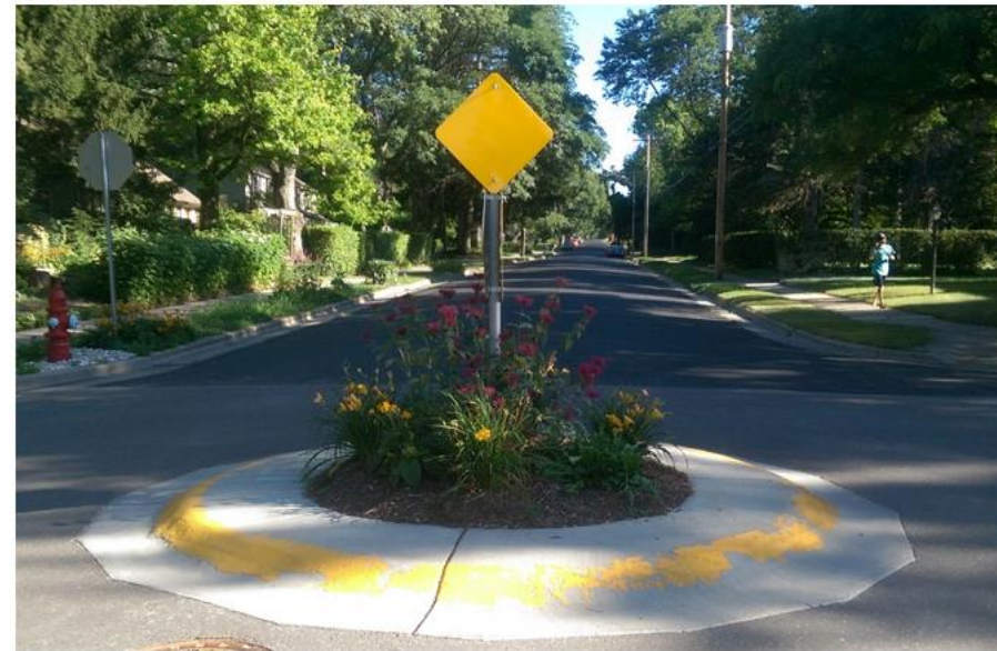
Neighborhood traffic circles