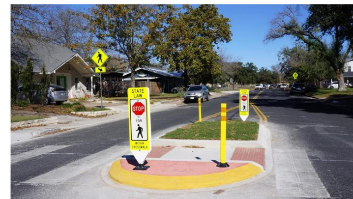
Median refuge island