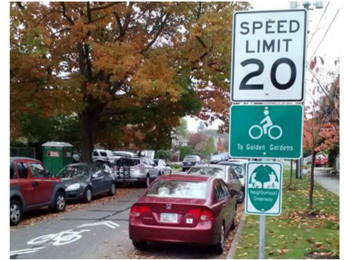
Reduced speed limit