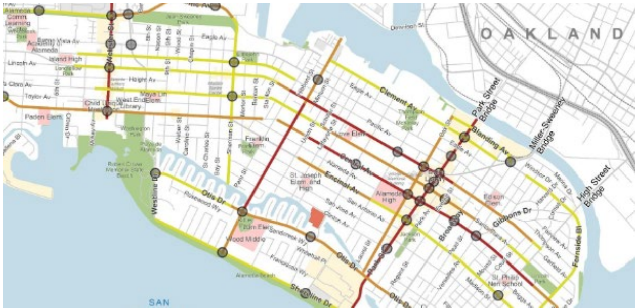
Grand Street on the City of Alameda All-Modes High Injury Corridor map

URL: www.alamedaca.gov/visionzero#section-4