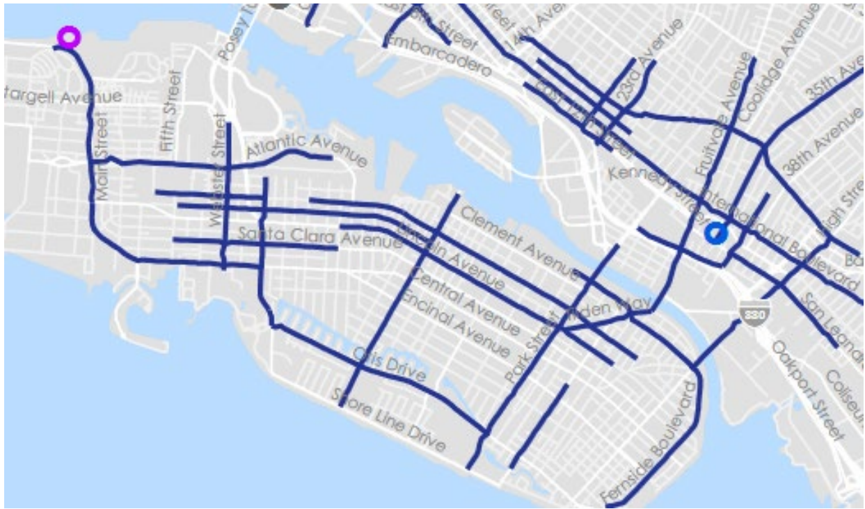
Grand Street on the Alameda CTC Bicycle High Injury Network

URL: https://www.alamedactc.org/wp-content/uploads/2019/06/RPT_CATP_Book-2_20190625.pdf (p. 49)