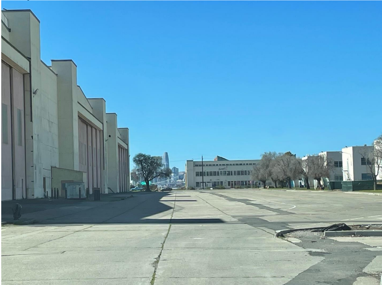
Image 1: View from West Midway Ave. and Lexington St., prior to the northward curve in West Midway Avenue

At the request of a Councilmember, staff are providing additional photographs of the current condition of the existing fence adjacent to the south side of the hangar at 2505 Monarch Street (Building 22). These photographs were taken by staff on March 15, 2024.