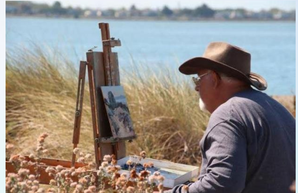
Plein Air Paintout Frank Bette Center August 2023