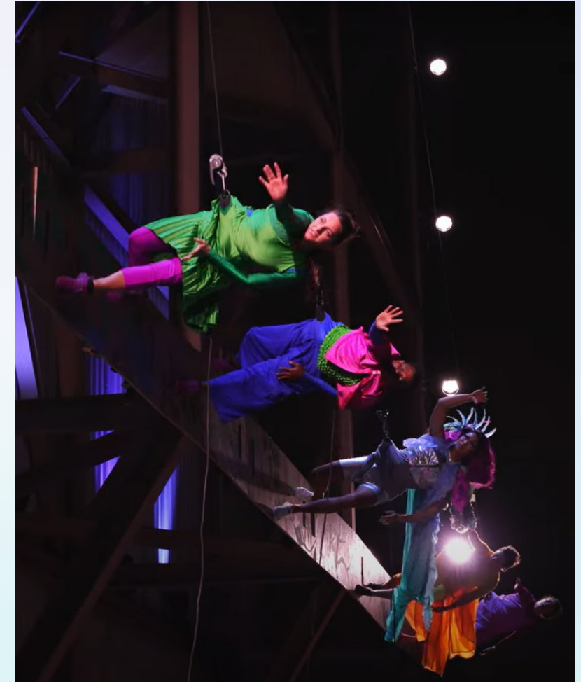
Somewhere to Land West End Arts District September 2024