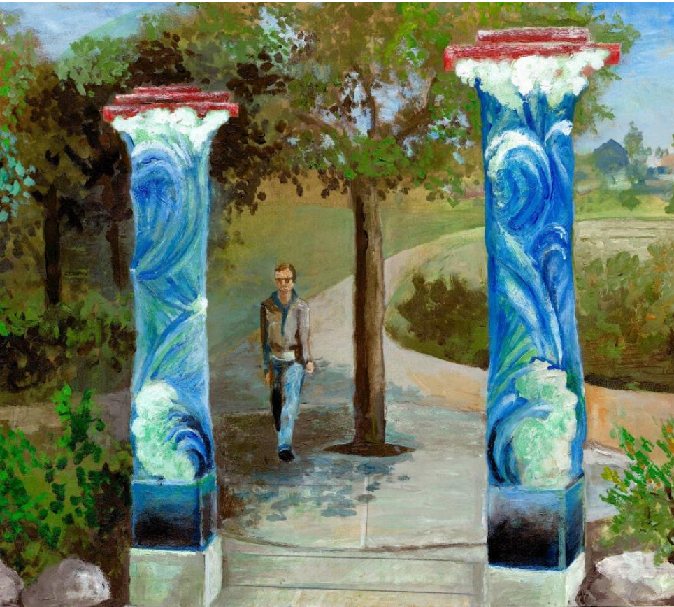
Artist rendering of the mosaic columns

Two mosaic columns form a gateway, symbolizing the island of Alameda as the gateway for prospectors and the railroad heading east.