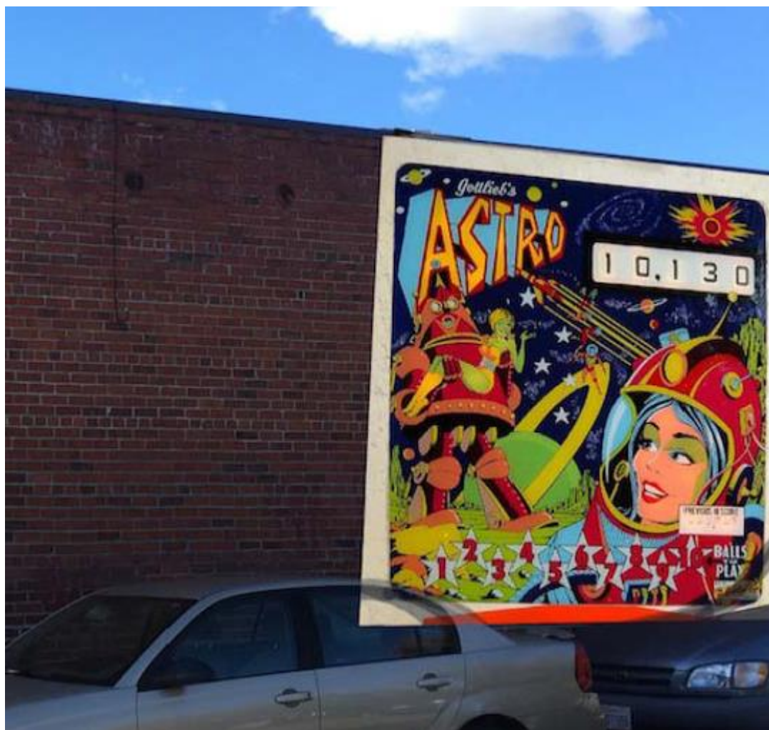
Artist rendering of the mural

The Astro Mural is a faithful depiction of the back glass for the 1971 Gottlieb game entitled "Astro." The mural would be painted on a 12'x12' large crezon wood panel.