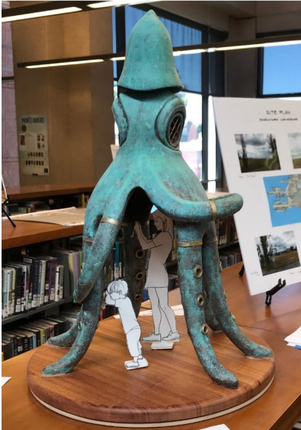
Photograph of scale model of the sculpture

This 12-foot tall bronze squid sculpture is envisioned as a design object rather than a realistic animal, with the tentacles working as arches and columns. It allows people to walk between the inner and outer space of the artwork.