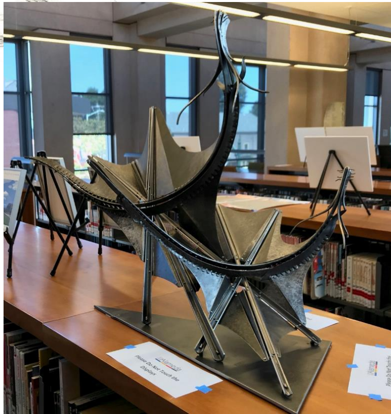
Photograph of scale model of the sculpture