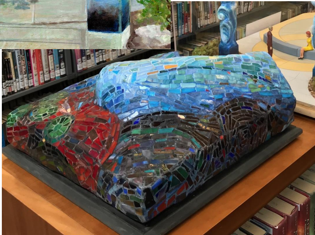
Example of the mosaic surface