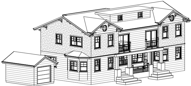
2 3D Proposed scale: