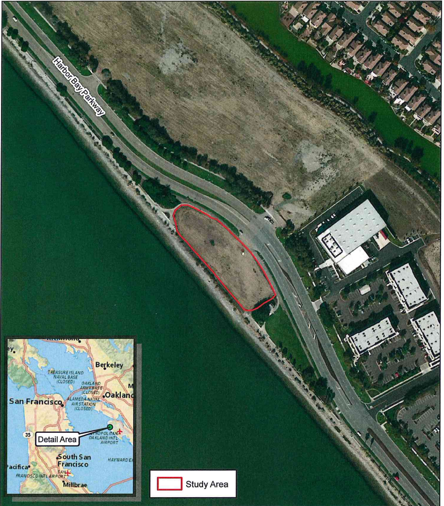
Figure 1. Study Area Location Map

2350 Harbor Bay Parkway Alameda, Alameda County, California