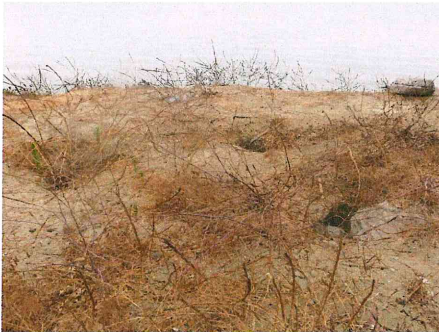
Top: Old/dilapidated ground squirrel burrow within the Study Area.