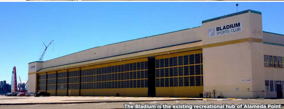
The Bladium is the existing recreational hub of Alameda Point