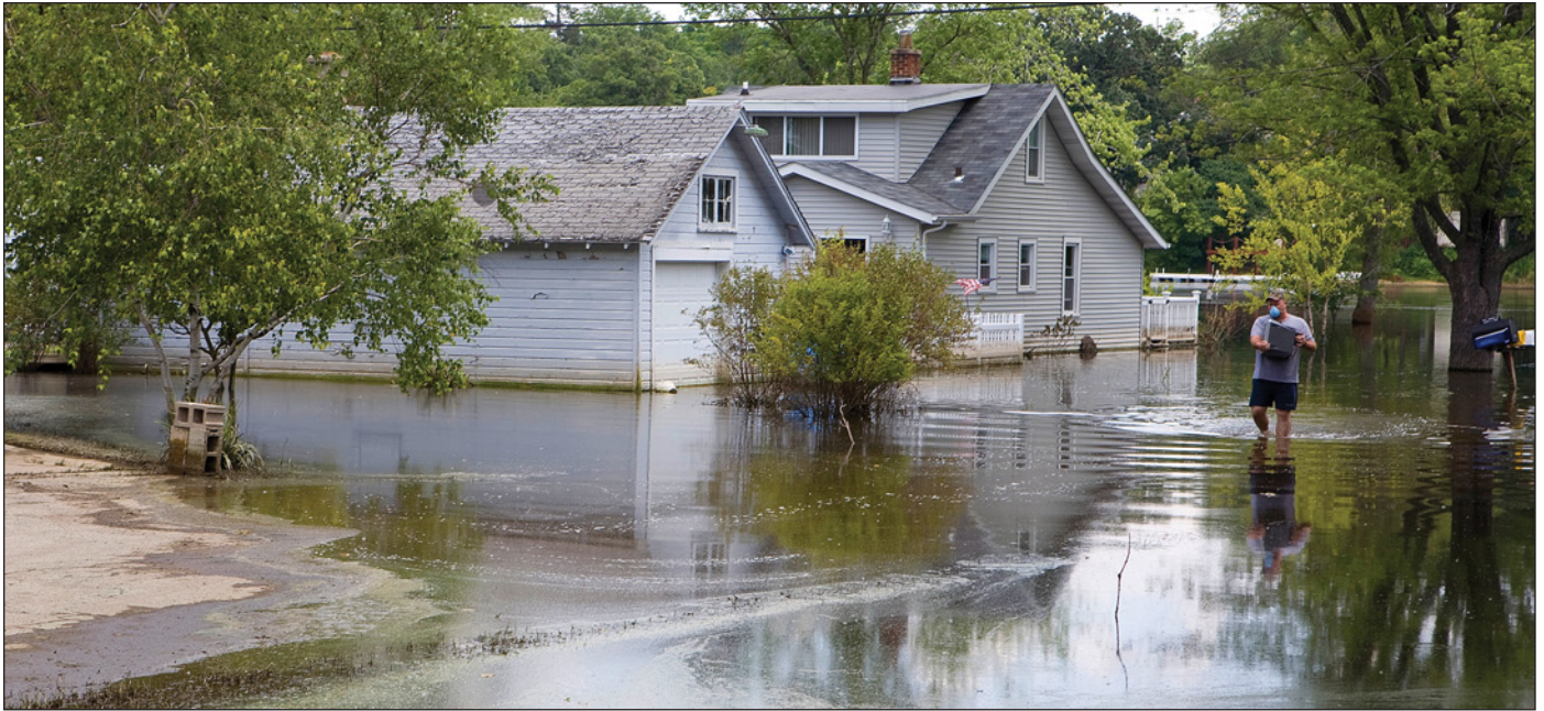
Janesville, Wisconsin, 2008