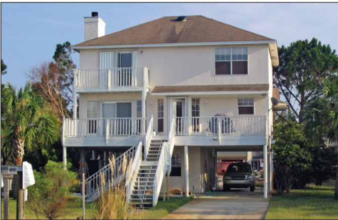
Elevated home on pile foundation