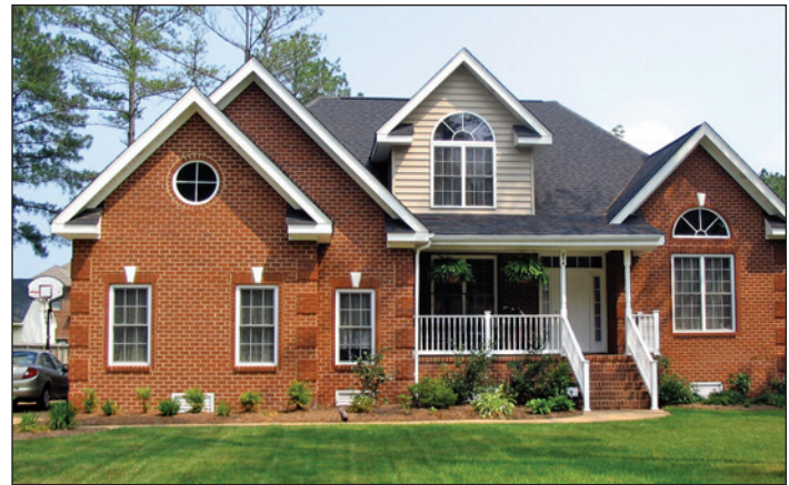
Elevated home on crawl space foundation

make conventional loans for insurable buildings in flood hazard areas of non-participating communities. However, the lender must notify applicants that the property is in a flood hazard area and that the property is not eligible for Federal disaster assistance. Some lenders may voluntarily choose not to make these loans.