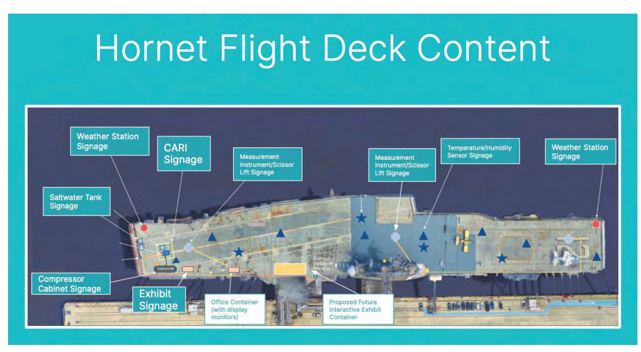
The proposed layout of educational and interactive content on the Hornet Flight Deck.