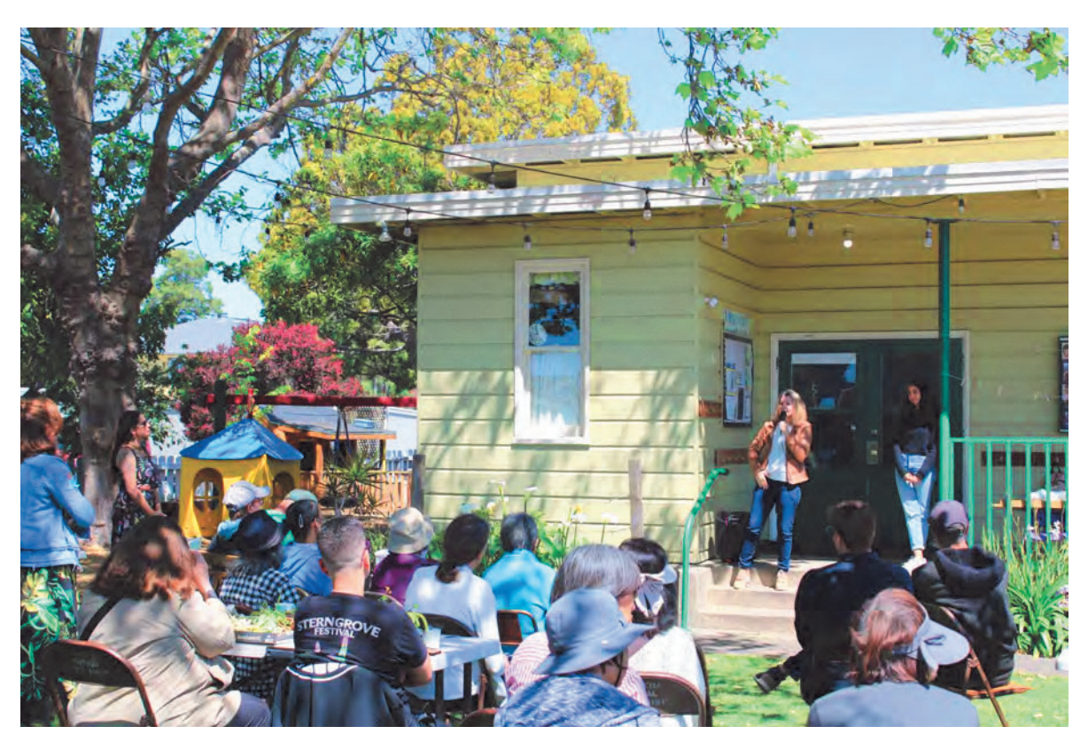
CAARE team members speaking at the 2024 Woodstock Homes Earth Day Fest.