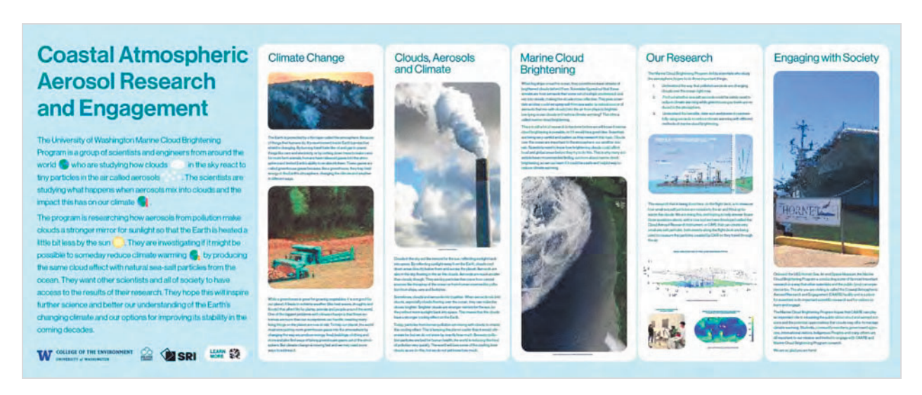
The CAARE education panel installed on the Hornet Flight Deck.

This panel is the first element of a planned, more extensive exhibit of installations across the Flight Deck, including both large panels and signage on instrument stations and on the Cloud Aerosol Research Instrument (CARI) explaining: