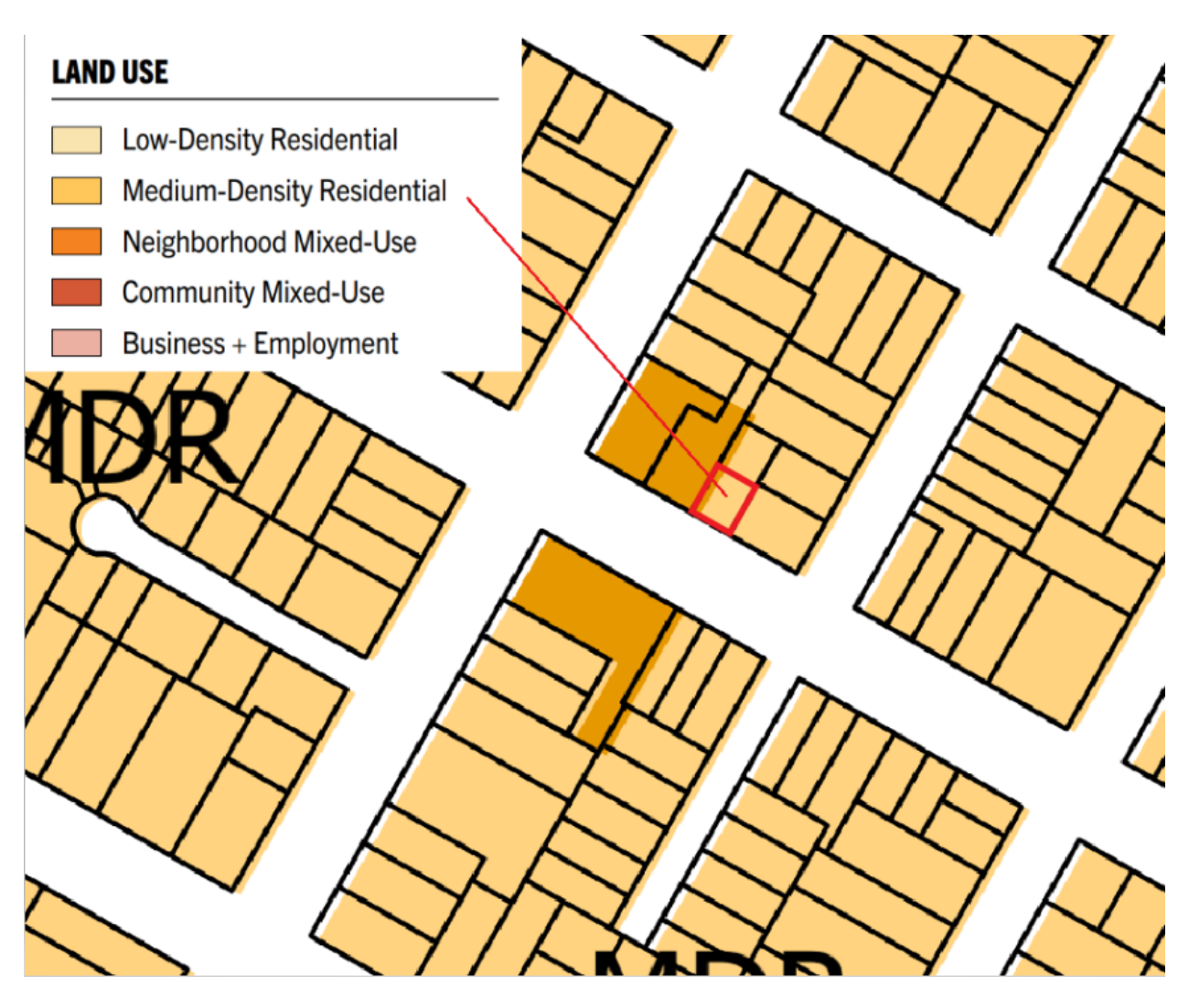
Exhibit 3 Item 5-B, July 24, 2023 Planning Board Meeting