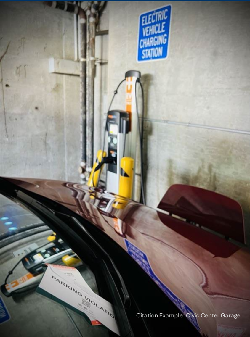
Citation Example: Civic Center Garage