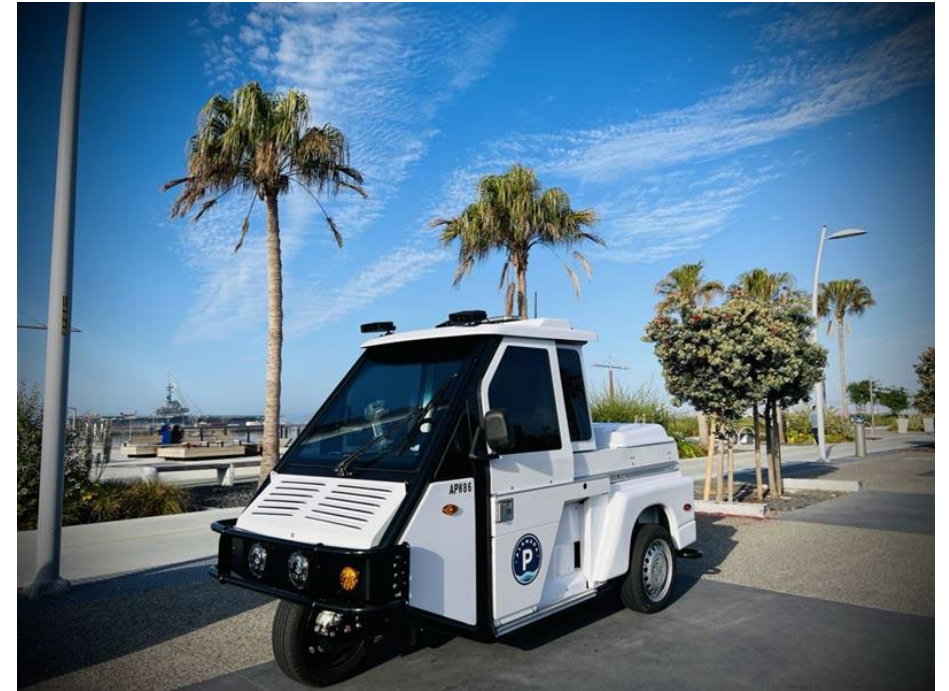
PW Enforcement vehicle – W. Atlantic Avenue