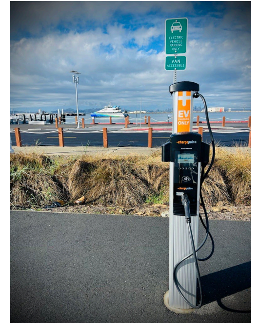
Charging stations at Civic Center Garage and Seaplane Lagoon Ferry Terminal