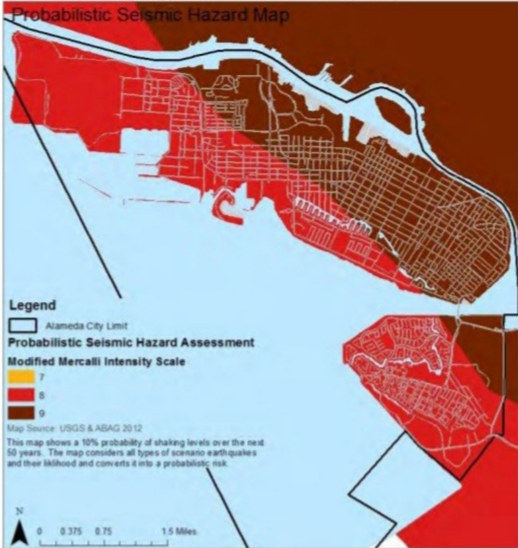
Figure 8. Probability Seismic Hazard Map