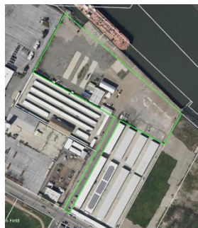
2199 Clement Avenue