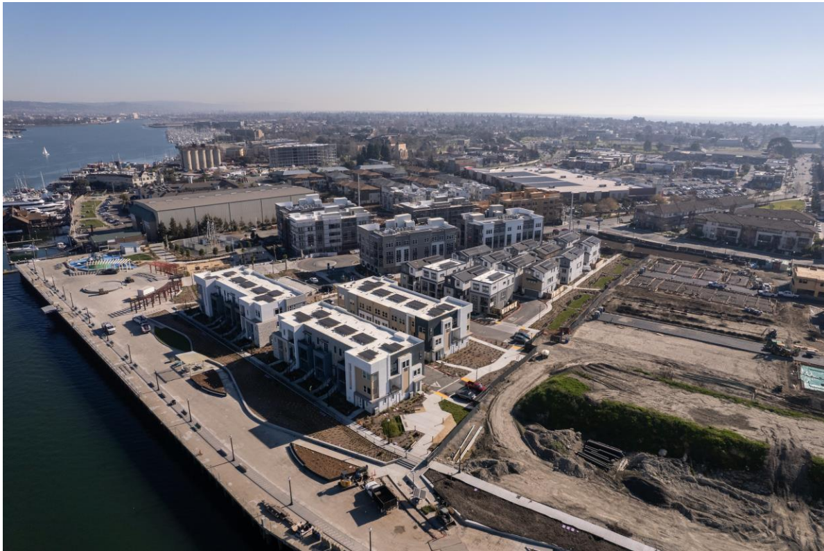
In 2021, work continued on the Alameda Landing Waterfront Park and adjacent residential neighborhood.

In 2022, the Planning Board, City Council and community also continued work on the 6 th Cycle update to the Housing Element. The Housing Element update and associated zoning code amendments will be ready for City Council consideration in December 2022.