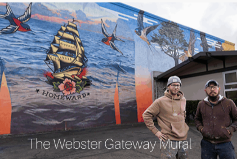
The Webster Gateway Mural