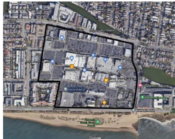
South Shore Shopping Center