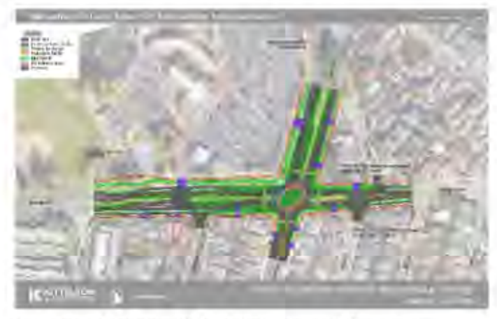
Alameda Mecartney/Island Roundabout Concept

As part of an on-call transportation engineering contract. Kittelson is working with the City of Alameda on a comprehensive effort related to the potential location, design, and implementation of roundabouts throughout the City. The team's tasks have included: a citywide high-injury network screening analysis using criteria sensitive to social and geographic equity to confirm locations identified by City staff as potential locations for roundabouts; a feasibility assessment of 10 likely locations for roundabout construction based on surrounding land use and potential roundabout footprint; recommendations for General Plan policies related to roundabouts; and designs and best practice resources for neighborhood traffic circles. Kittelson is also conducting alternatives evaluation at Mecartney Road/Island Drive and Clement Avenue/Tilden Way and developing preliminary engineering concepts for other intersections. Kittelson has prepared a draft concept for the preferred roundabout alternative at Mecartney Road/Island Drive and is supporting the City with engagement coordination and Council approvals.