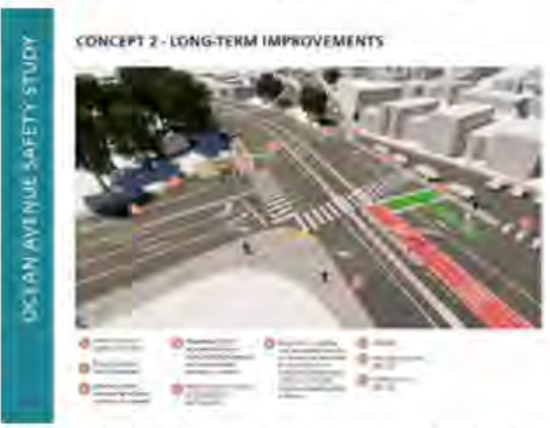
San Francisco - Ocean Avenue concept rendering

Kittelson assisted the San Francisco Municipal Transportation Agency (SFMTA) with the development of conceptual designs for the intersection of Ocean Avenue, Geneva Avenue, and Frida Kahlo Way. This complex intersection serves a significant amount of vehicle traffic, several Muni bus and streetcar/light rail lines, and important walking and bicycling connections, including to City College of San Francisco. Kittelson has developed conceptual designs and cost estimates for near- and long-term concepts that improve safety, accessibility, and comfort for people approaching and traveling through the intersection. Kittelson evaluated alternatives with qualitative and quantitative metrics including multimodal safety, transit priority and reliability, vehicle operations, multimodal accessibility and circulation, and impacts to parking.