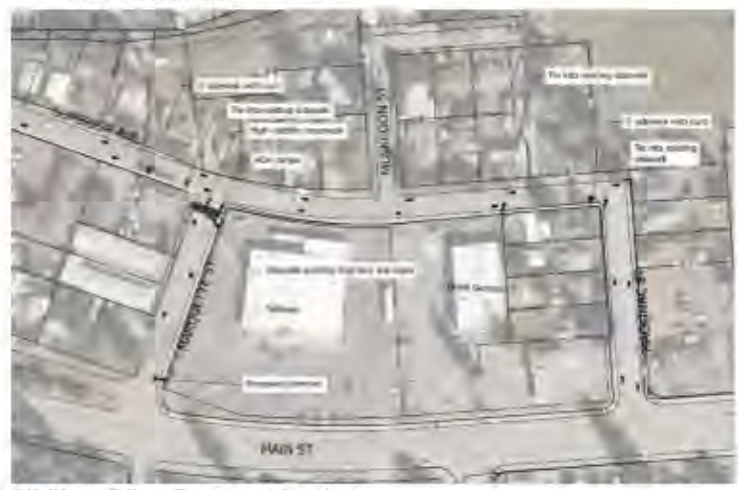
Pit River Tribe Concept Design