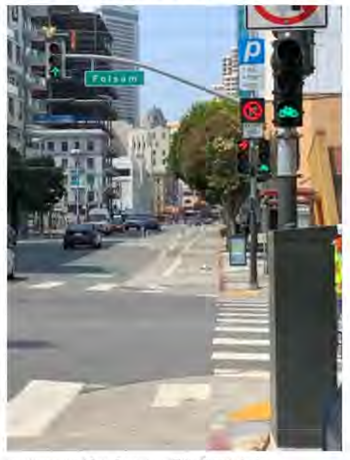
Implemented San Francisco Fifth Street design

When Kittelson began working with the SFMTA on the 5th Street Streetscape Project, 5th Street between Townsend Street and Market Street was a two-way, four-lane undivided street with on-street parking and curbside loading/unloading. The corridor was serving multiple Muni bus lines and commuter shuttles and