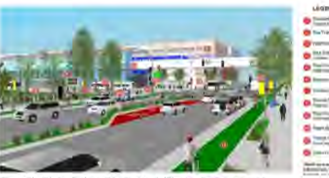
E. 14th St./Mission Blvd. Mobility Hub Concept

Kittelson completed the planning (Xitelson the project to identify improvements that establish a long-term vision for the corridor while also being implementable over time through a series of incremental projects. The current phase began in late 2020 and focuses on the design and implementation of near-term bikeway, transit, and streetscape improvements in San Leandro, unincorporated Alameda County, and Hayward.