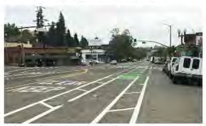
Oakland Grand Avenue Road Diet

Grand Avenue Road Diet. Kittelson evaluated the feasibility and multimodal impacts of converting Grand Avenue from Elwood Avenue to Jean Street from a four-lane undivided roadway with on-street parking to a three-lane roadway with Class II bike lanes. Kittelson conducted technical analysis, identified changes to the proposed configuration, developed plans for implementation, documented findings, and helped conduct public outreach. Kittelson has conducted similar studies for Oakland including the Upper Broadway Road Diet.