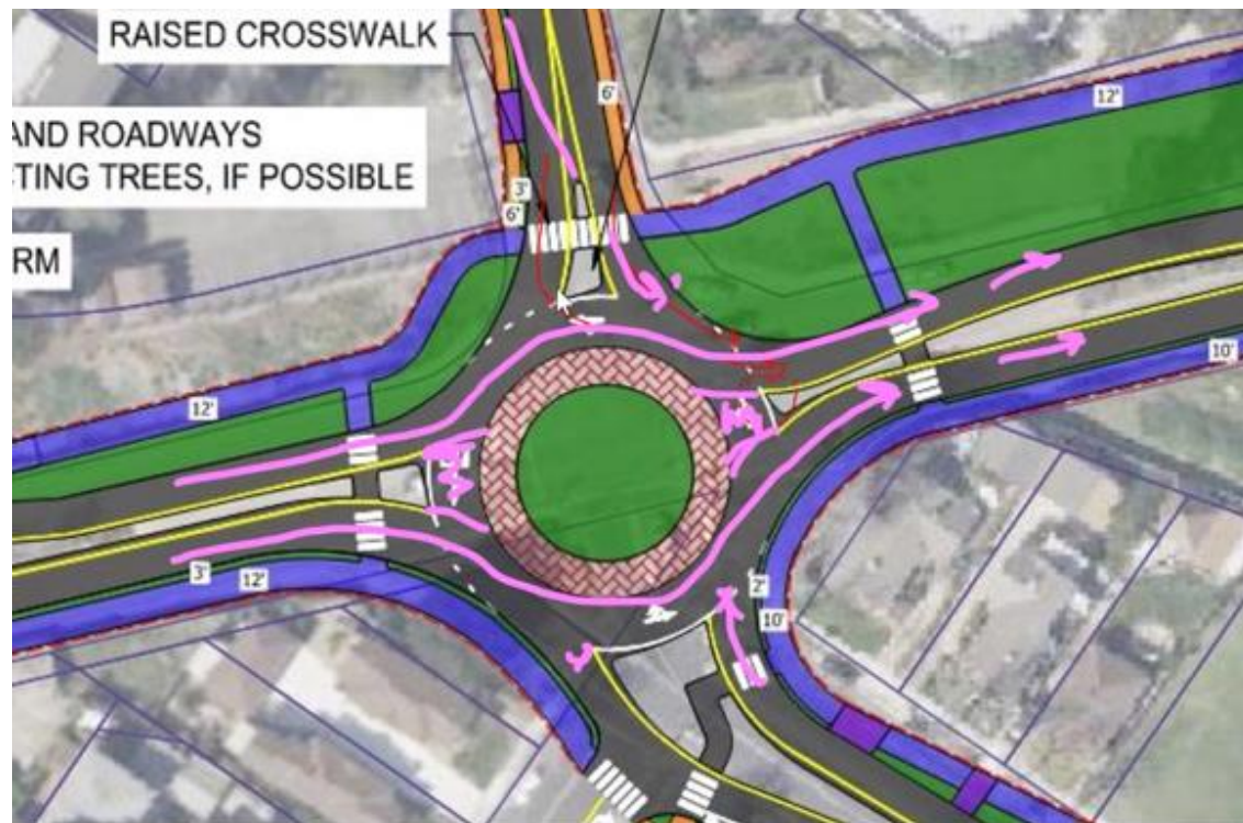
Figure 7: Potential Roundabout Operations in a Managed Evacuation Scenario

The City is currently developing an evacuation planning tool that will allow it to test various scenarios, which will allow further development of the scenarios described above. Coordination with the City of Oakland would be required to maximize evacuation capacity, and lane reduction along Tilden Way may not present a practical limit to evacuation capacity.