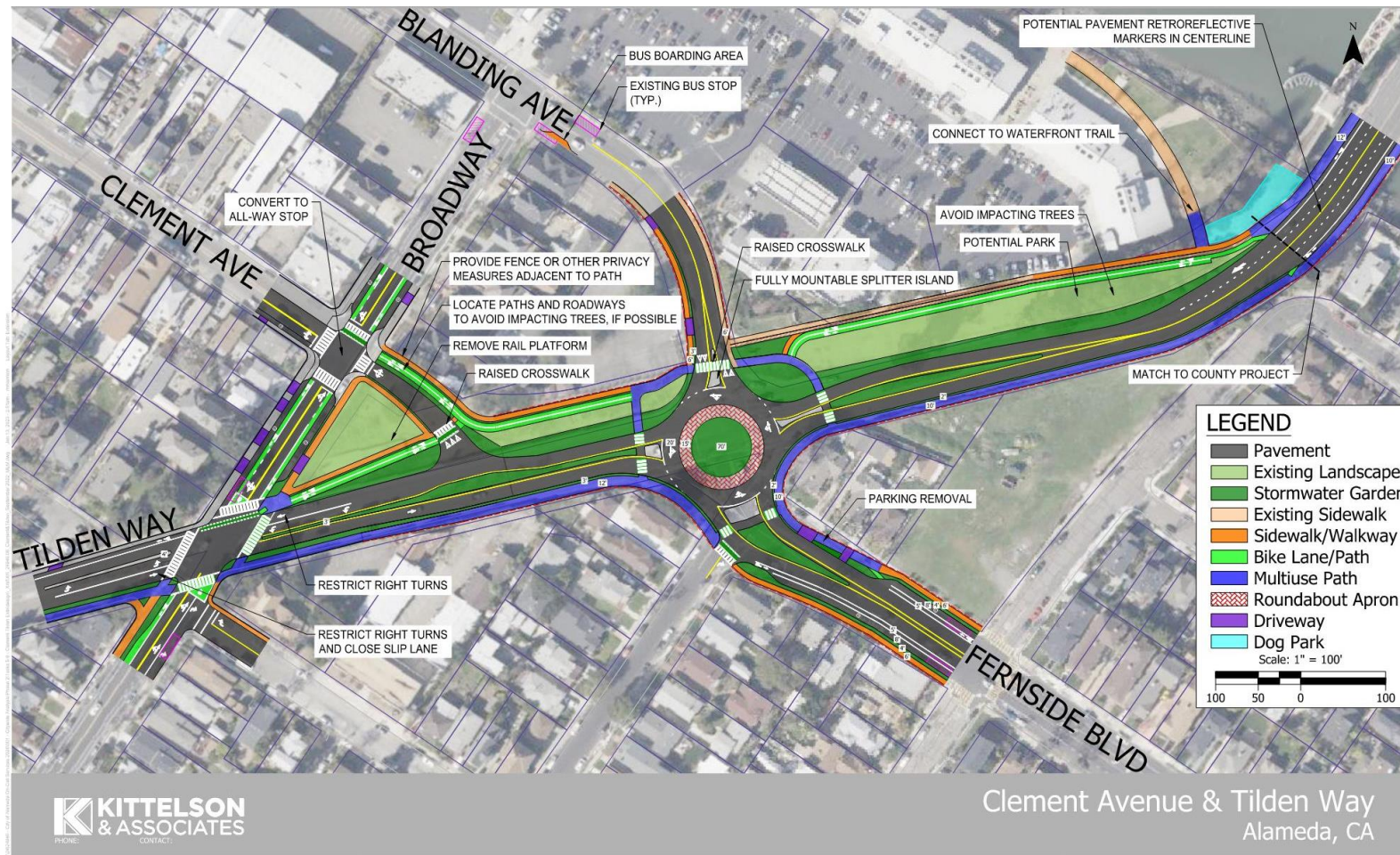
Figure 1: Recommended Alternative Concept