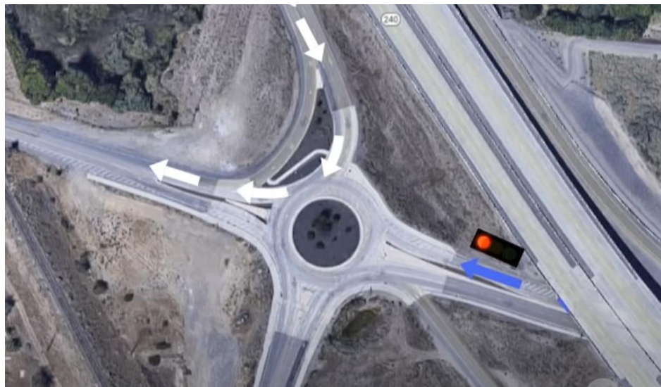
Figure 3: Roundabout Metering Example

(a) Detectors installed on the north leg indicate a queue extending past a certain distance, triggering a red indication on the east leg