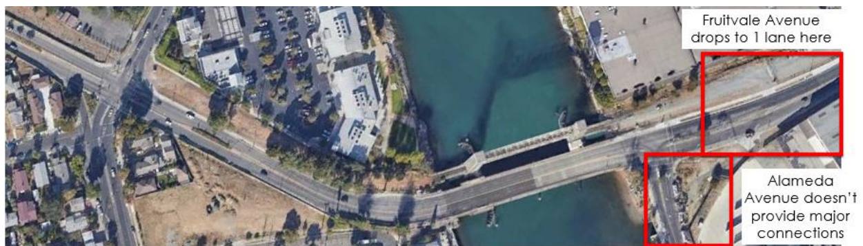
Figure 6: Project Area in Relation to Evacuation Capacity

There are many possible evacuation scenarios, but in the event the island needs to be evacuated with the proposed project built, there are two basic scenarios as described below: