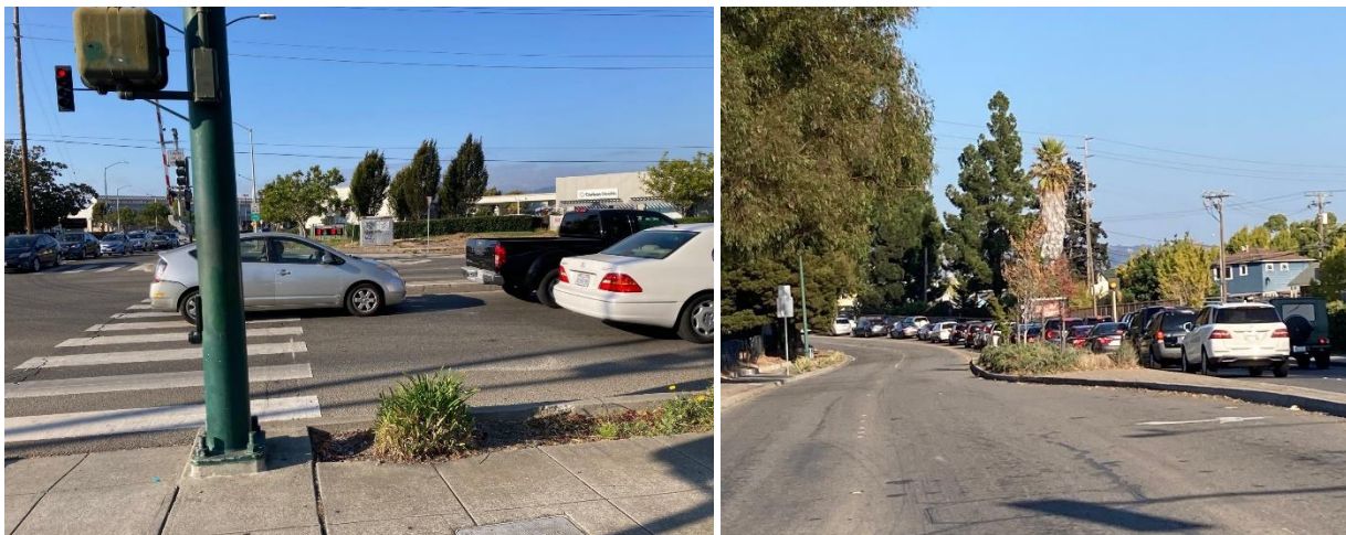
Figure 5: Vehicle Traffic at Fruitvale / Tilden / Blanding / Fernside

The proposed project would have little if any effect on the Miller-Sweeney Bridge operations. As shown in Figure 2, vehicle queueing into the City along Tilden Way would on average be longer than under existing