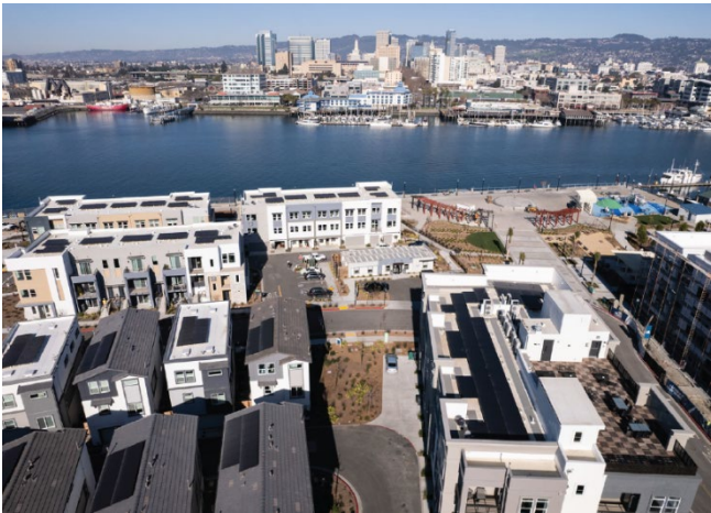
View of the Oakland Estuary from Alameda looking towards downtown Oakland