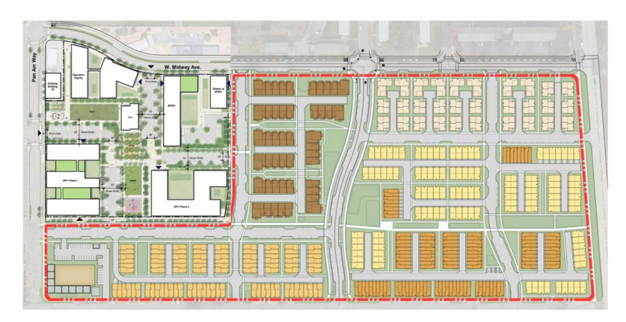
Figure 1: West Midway and RESHAP Site Plans

The proposed projects include a variety of building types, including townhomes, condomiums, stacked flats, and commercial spaces. All the residential buildings will be between three and four stories with a maximum height limit of approximately 50 feet. A freestanding one story commercial building is proposed at the corner of Pan Am and West Tower in the lower left corner of the property.