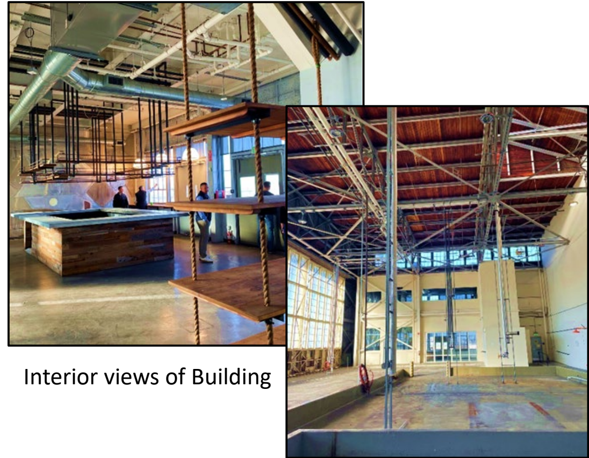
Interior views of Building