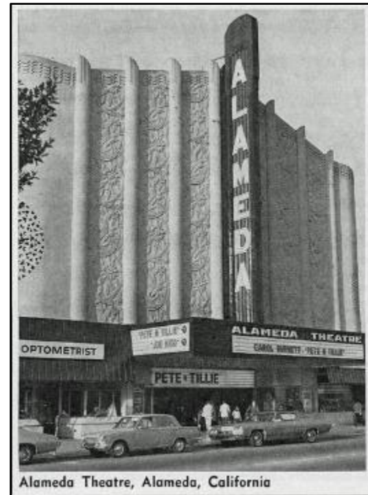
Alameda Theatre, Alameda, California