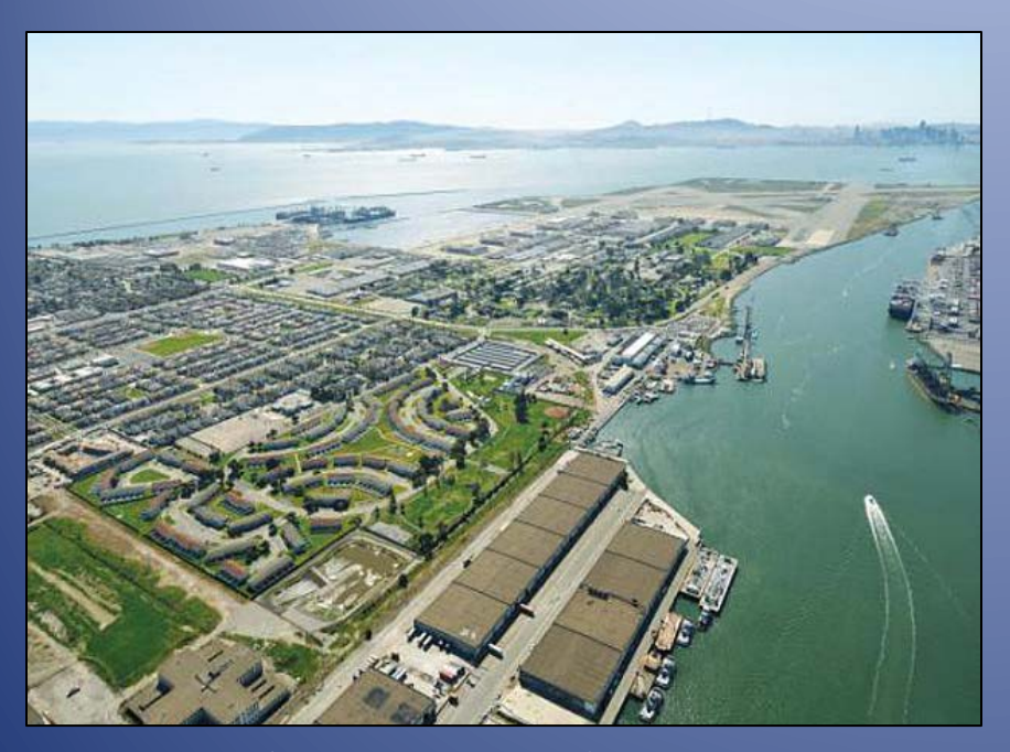
It would look even better if it wasn't underwater.