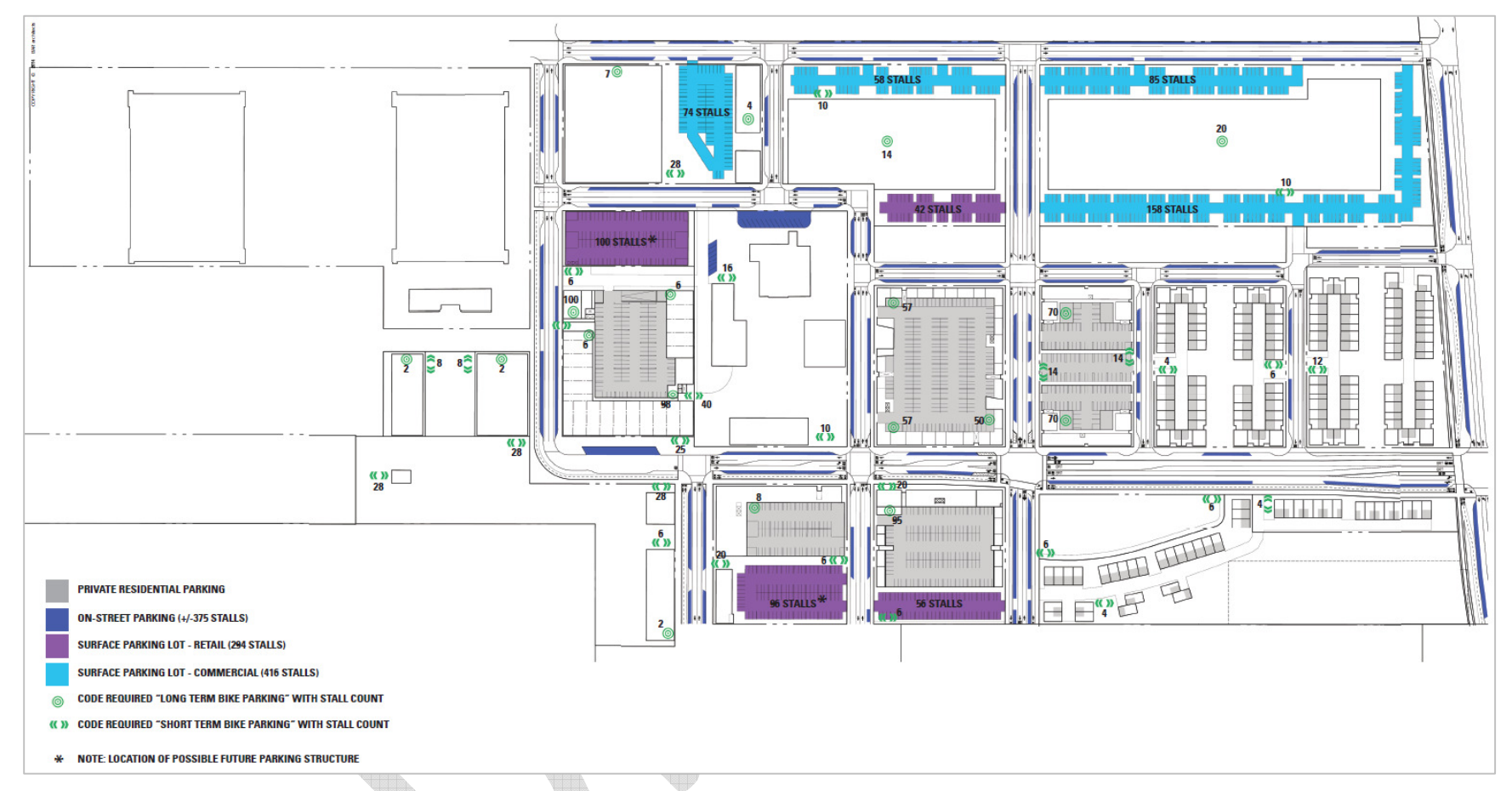
Figure 6-1 Proposed On- and Off-Street Parking Supply