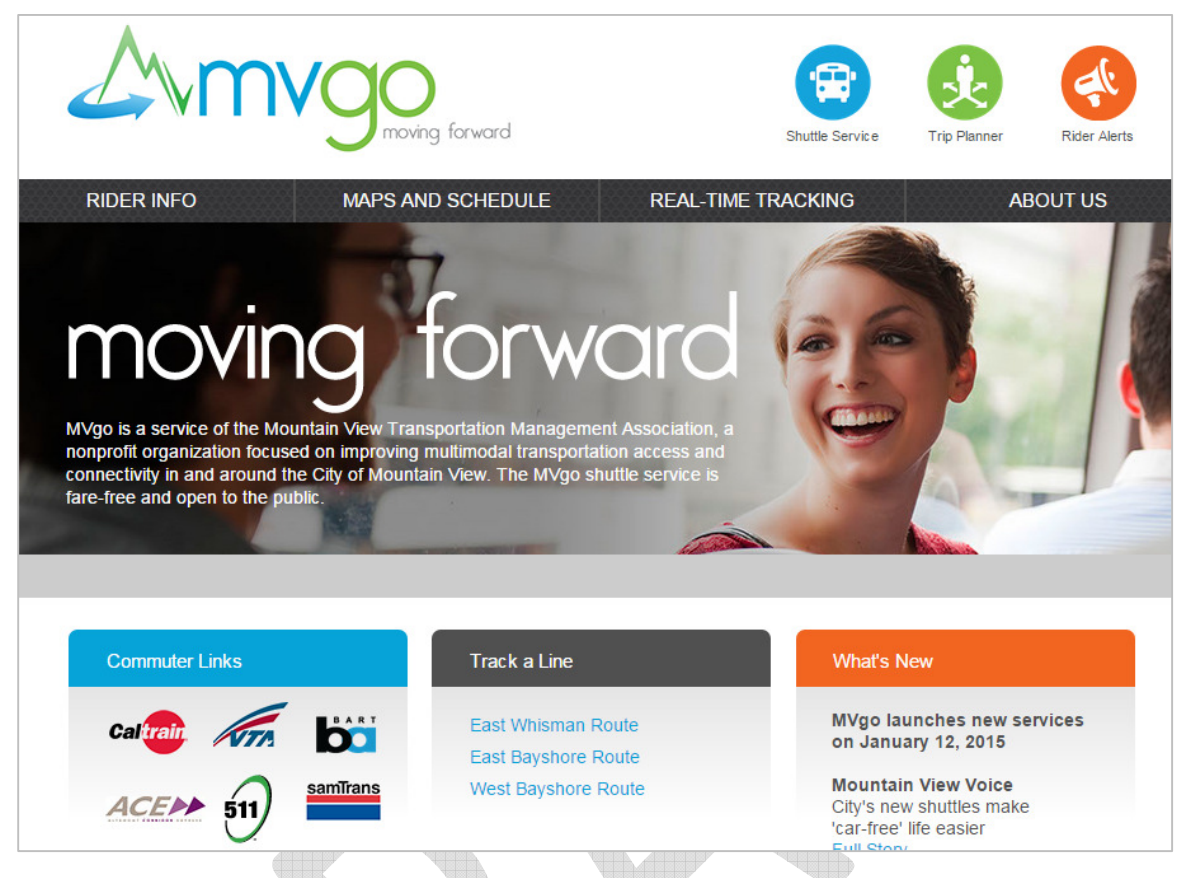
Figure 4-2 Example TMA Website (Mountain View)