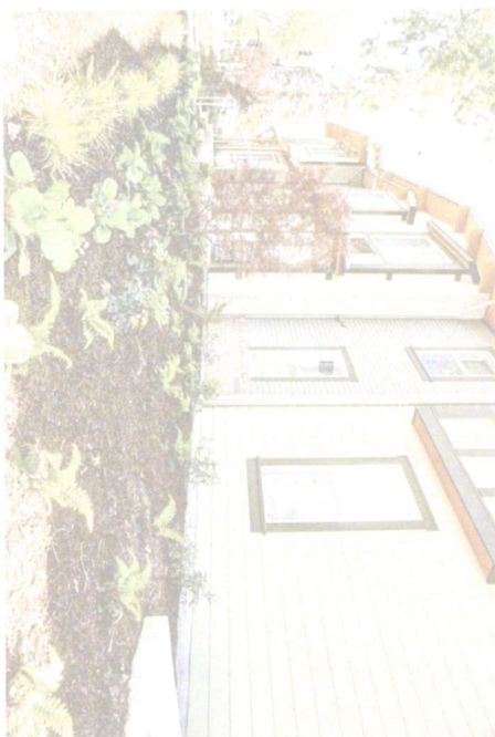
Weinreb Place Courtyard and Front Yard