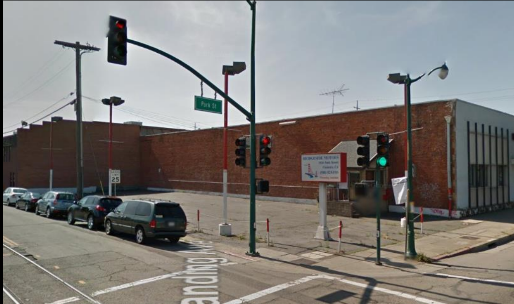
1926 Park Street Use Permit and Design Review