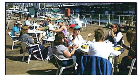
The Alameda Marina is open to the public during daytime hours.

If we lose the maritime services, the boating communities will relocate away from Alameda.