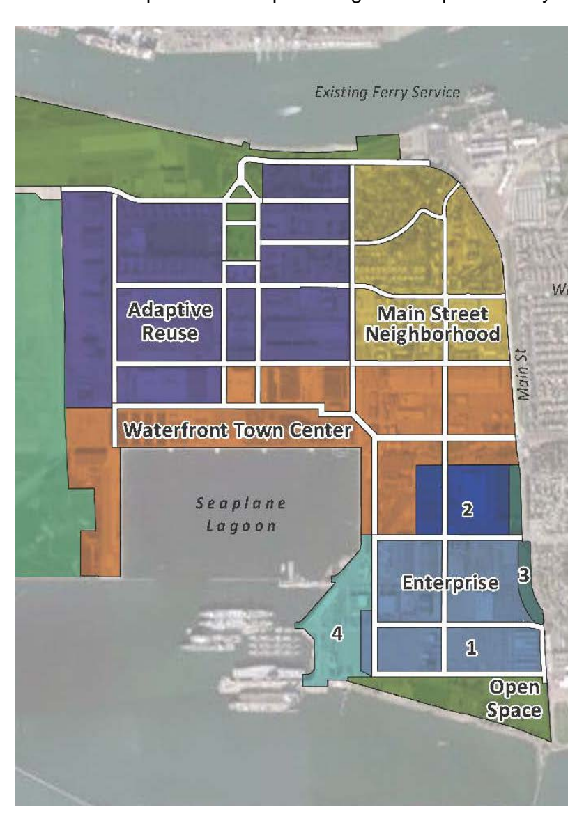
Zone 4 - This area abuts the piers and Seaplane Lagoon and permits only working waterfront uses.

Together, these sub-areas are intended to create opportunities for catalytic commercial uses with spin-off potential to other areas of Alameda Point and increased job creation overall. It is likely development would begin in Zone 2, taking advantage of the efficiencies of locating adjacent to the Site A waterfront development and existing infrastructure improvements in Main Street. Zone 1 and 3 would be the focus of the next stage of development for large campus-type users with emphasis on job and sales tax generators. The attraction of maritime and waterfront uses to Zone 4 will be on-going and will build upon the existing maritime uses within the sub-area. The proposed Seaplane Lagoon Ferry Terminal with 3-4 commuter routes to and from San Francisco is highly anticipated by the development community will be a major boost to the area once construction is completed and operations begin in 2020.