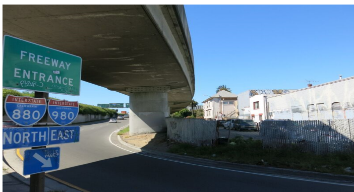
Figure 2: "freeway entrance on Jackson Street and 6th Street to north bound I-880 and eastbound I-980. h Broadway off-ramp will 6th Street a through street"

◇ Opportunities for public input: (1) Public Scoping Meeting (2) Public Hearing Meeting