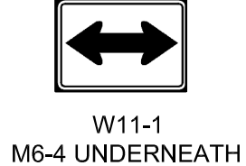
W11-1 M6-4 UNDERNEATH