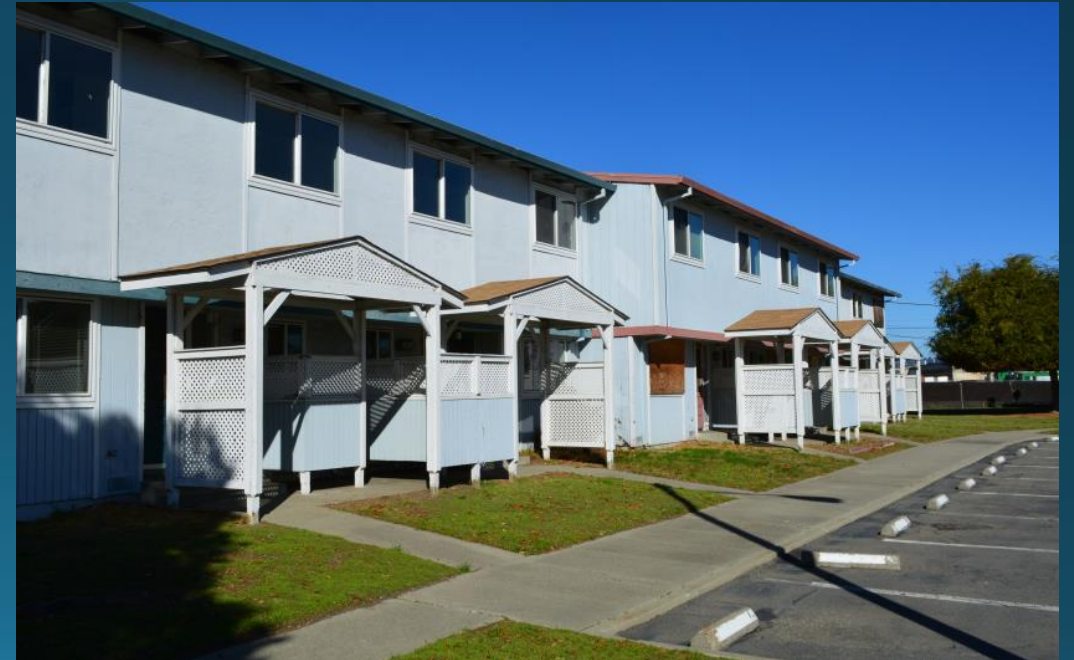
North Housing 146 vacant rental townhomes to be rehabilitated