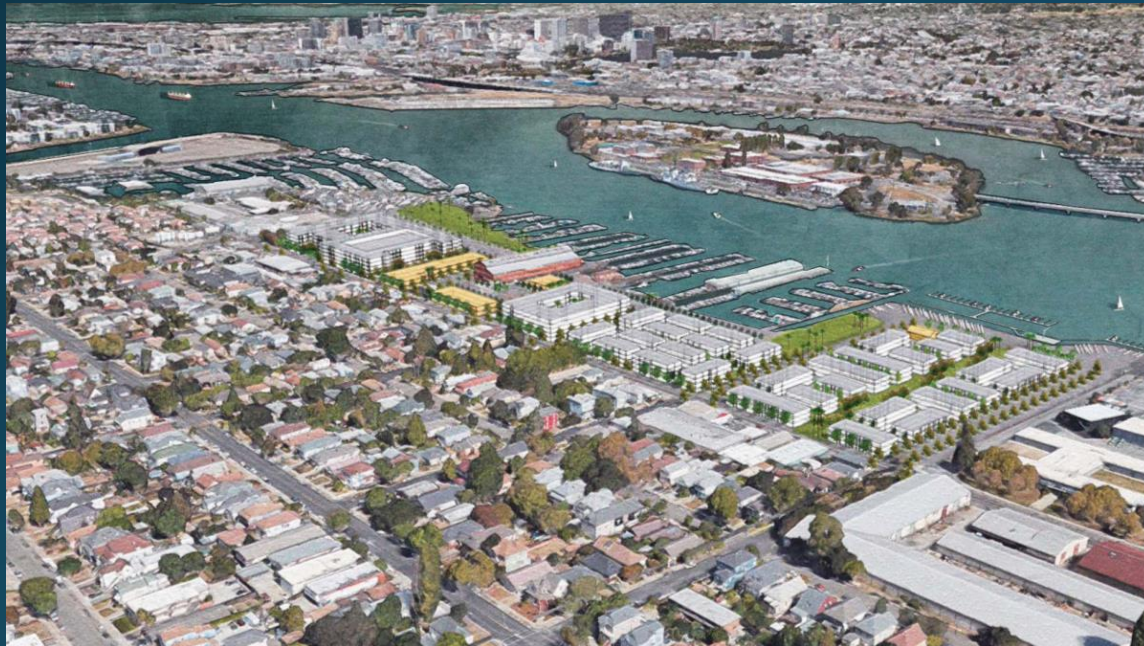
Alameda Marina Draft Master Plan for 776 residential multifamily units