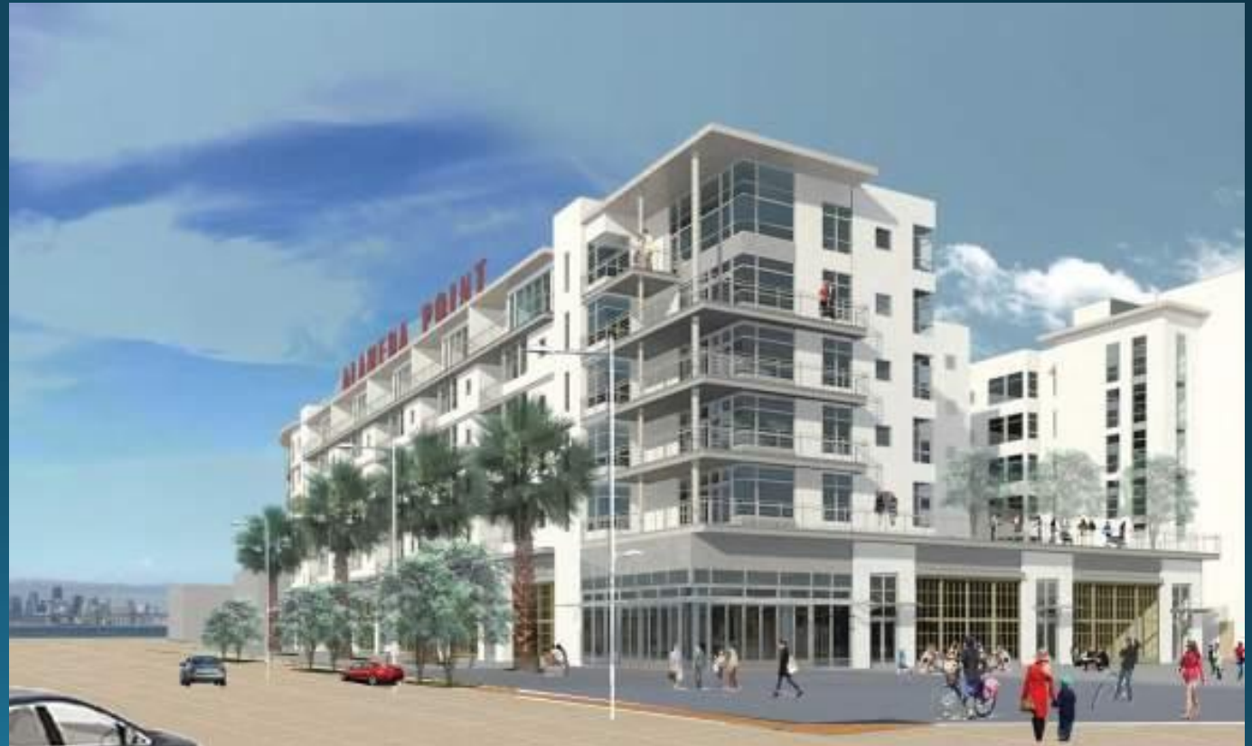
Alameda Point Site A Block 11 - 200 rental apartments.