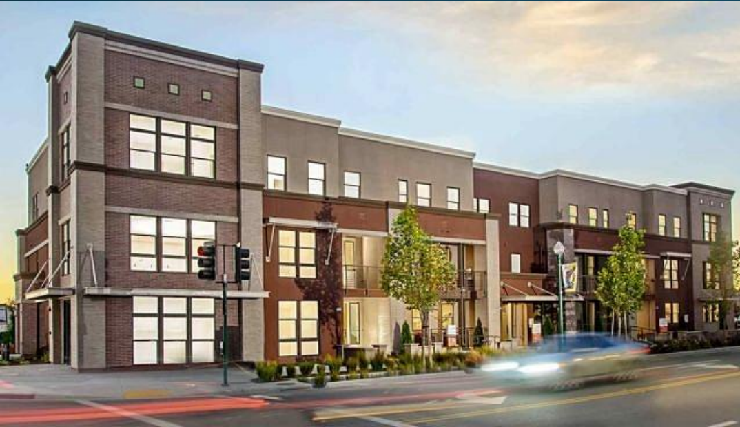
Alameda Landing attached townhomes, with ground floor commercial space on corner.

City must zone land to accommodate RHNA.