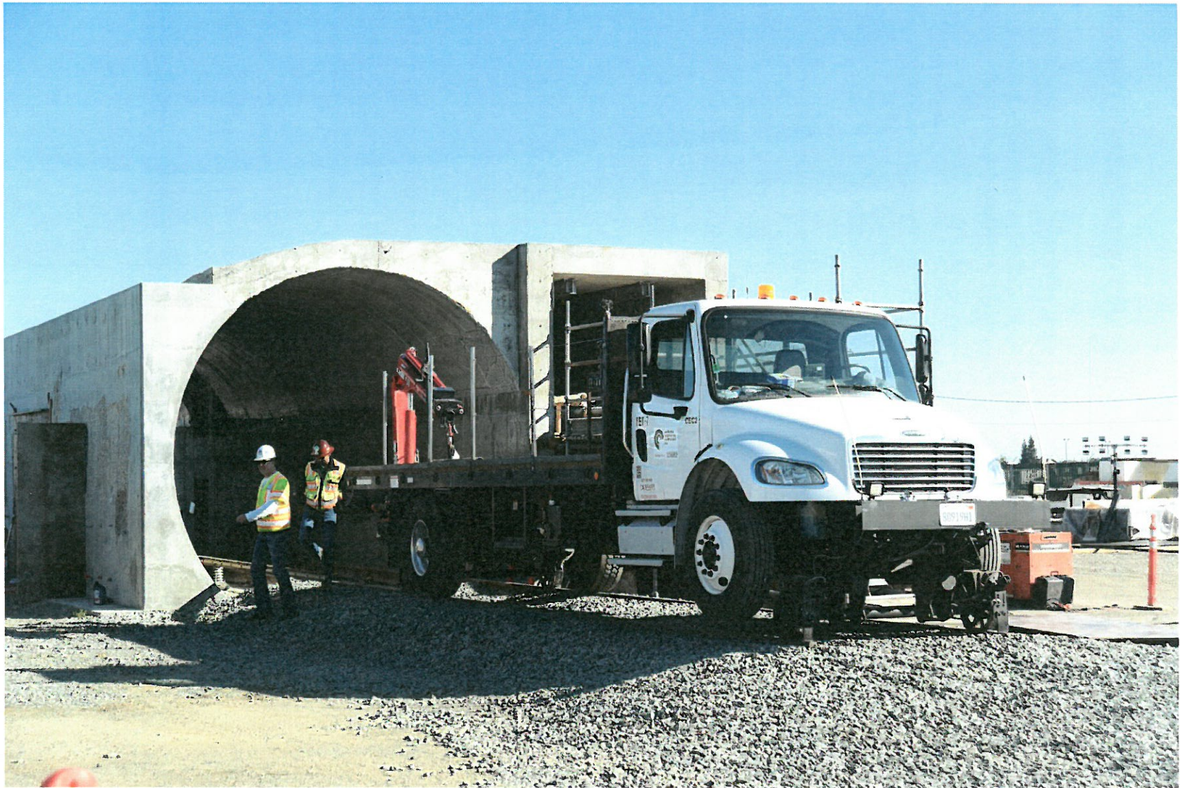
20' Flatbed Truck - Average 2 Trucks per day