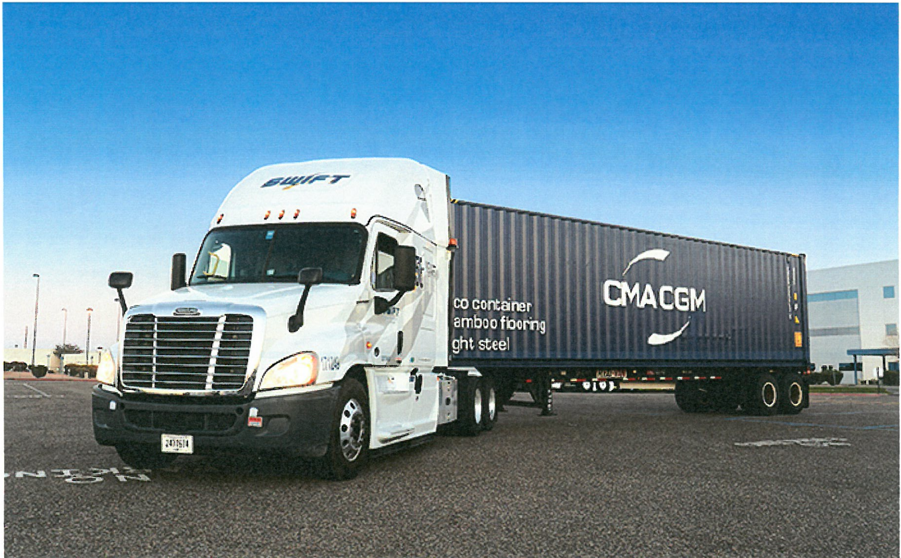
40' Cargo Container – Average 1 Truck per day.