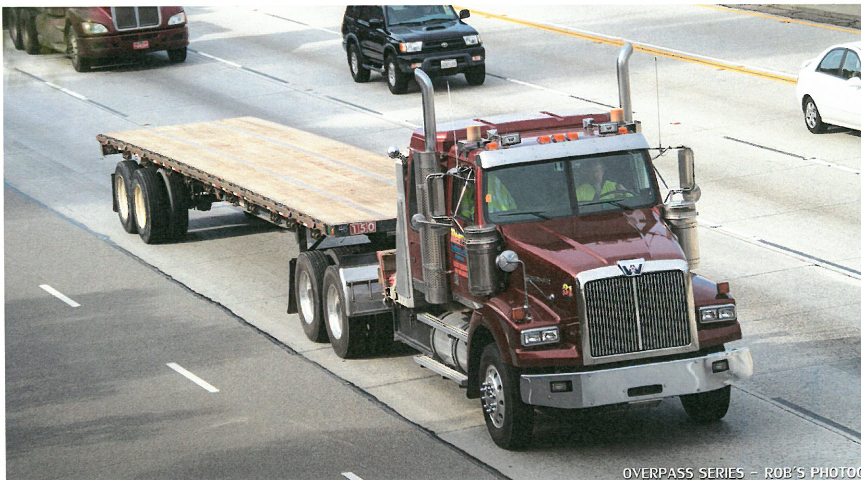
40' Flatbed Trailer – Average 6 Trucks per day