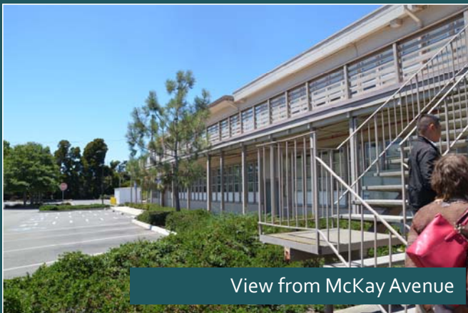
View from McKay Avenue