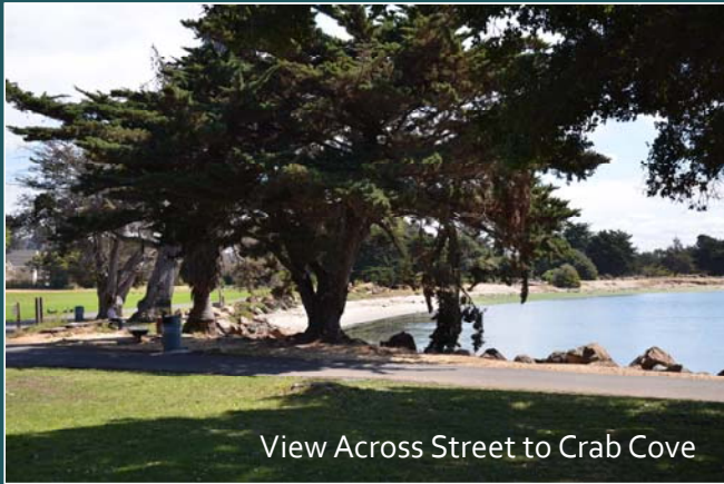
View Across Street to Crab Cove