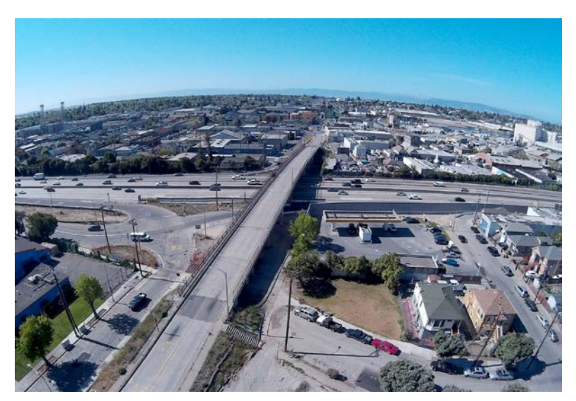
Pre-demolition of the 29th Avenue overcrossing, courtesy of Caltrans.