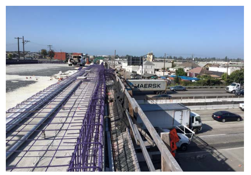
Nearly completed 29th Avenue overcrossing, courtesy of Caltrans.