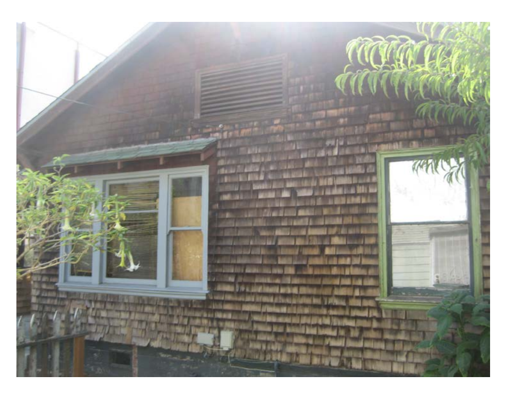
Front Elevation (East)