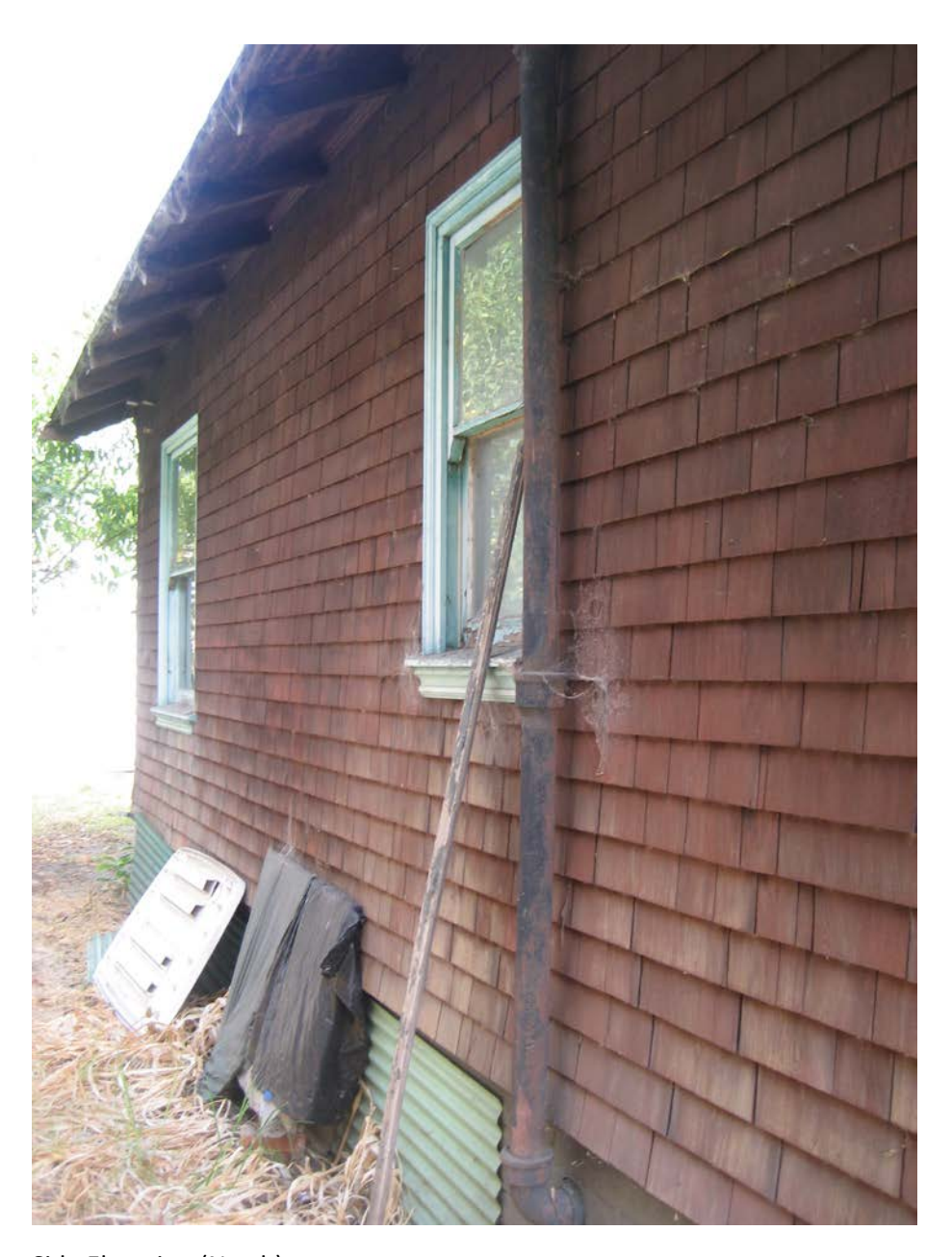
Side Elevation (North)