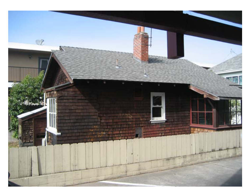
Side Elevation (South)