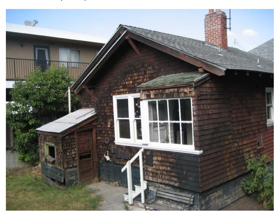
Rear Elevation (West)