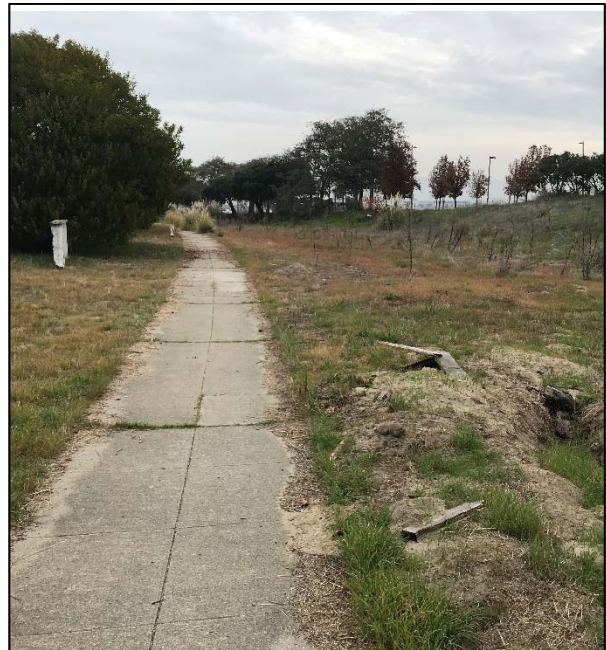
Photo 3. Sidewalk on eastern edge of Study Area.