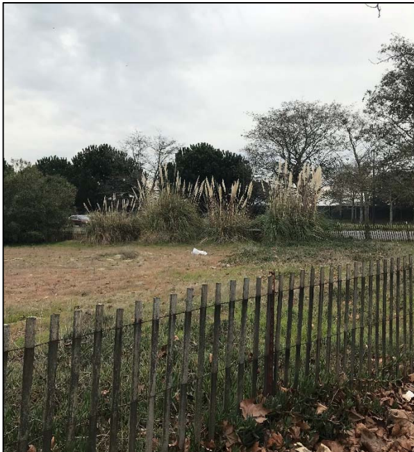
Photo 2. View of the southwestern portion of the Study Area, facing south.