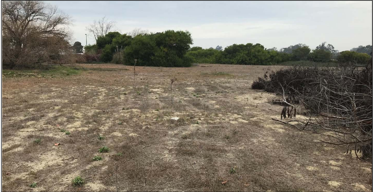
Photo 1. View of Study Area, facing north.