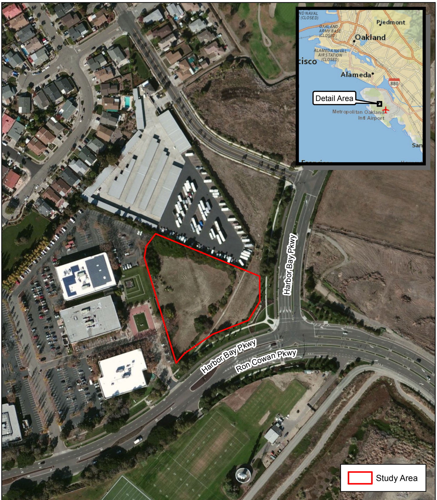
Figure 1. Study Area Location Map

1051 & 1047 Harbor Bay Blvd. Alameda, Alameda County, California