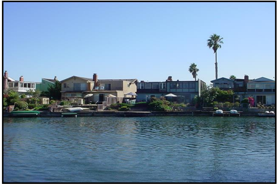
Homes on a lagoon