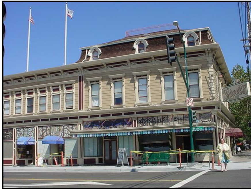
Webster Street, Croll's Tavern

A Strategic Plan Committee appointed by the City Council in 1988 gave Alameda a "C" for retail shopping, and conducted a survey of issues that identified "improved shopping/more convenient shopping" as a major need and opportunity. A question is how much more business can be attracted to Alameda, which is out of the way for nonresidents and does not have a large enough population to support large department stores or high-volume discounters. Three sources of increased sales will be: new residents, nonresidents attracted to restaurants and boating-related businesses, and the rising per capita disposable income of existing residents. Improved merchandising can capture sales made to Alamedans at off-Island locations.